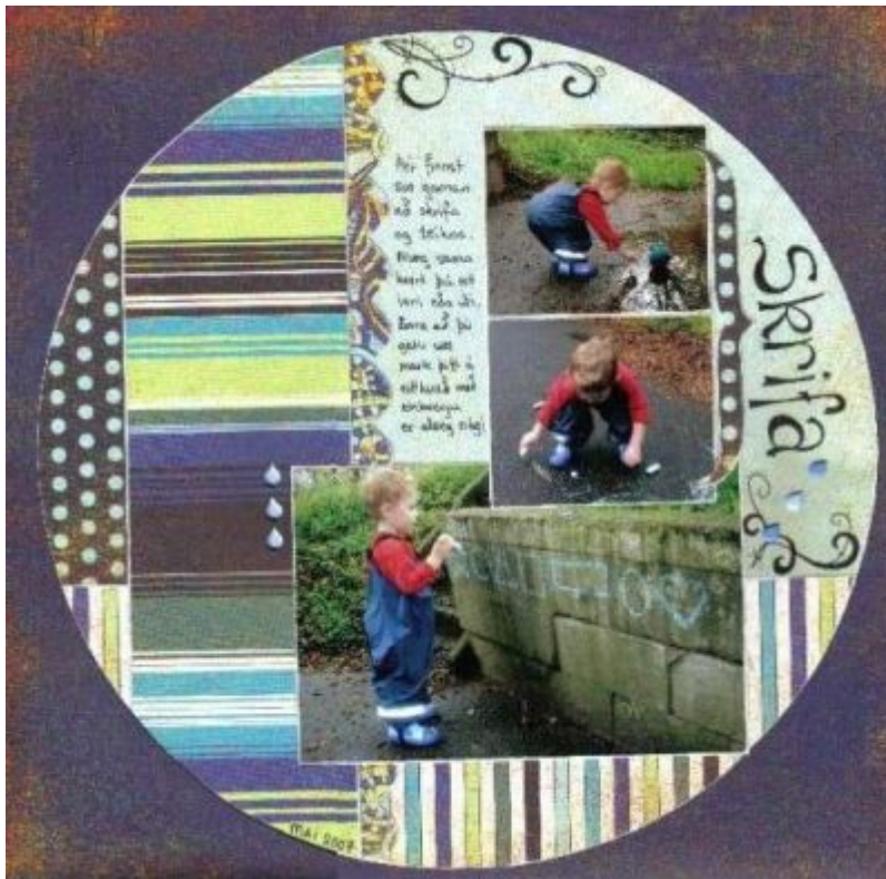
Layout by Hulda P

What will you write about, in your layout about writing? These are only suggestions because I am sure you can find many more reasons to create a layout around a "writing" theme. What other ideas would you think of? Share them in the comments below and if you already have a "writing" layout, share a link