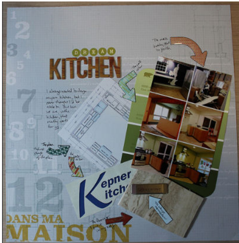
Layout by Heather Dubarry

Lori, on the other hand, focused on details of the renovation instead of the wider angle. And it also tells a story. A different story, but still something fun to revisit later. Her approach to the layout shows a different way to display her photos.