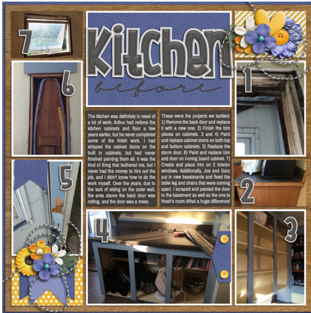
Layout by Lori