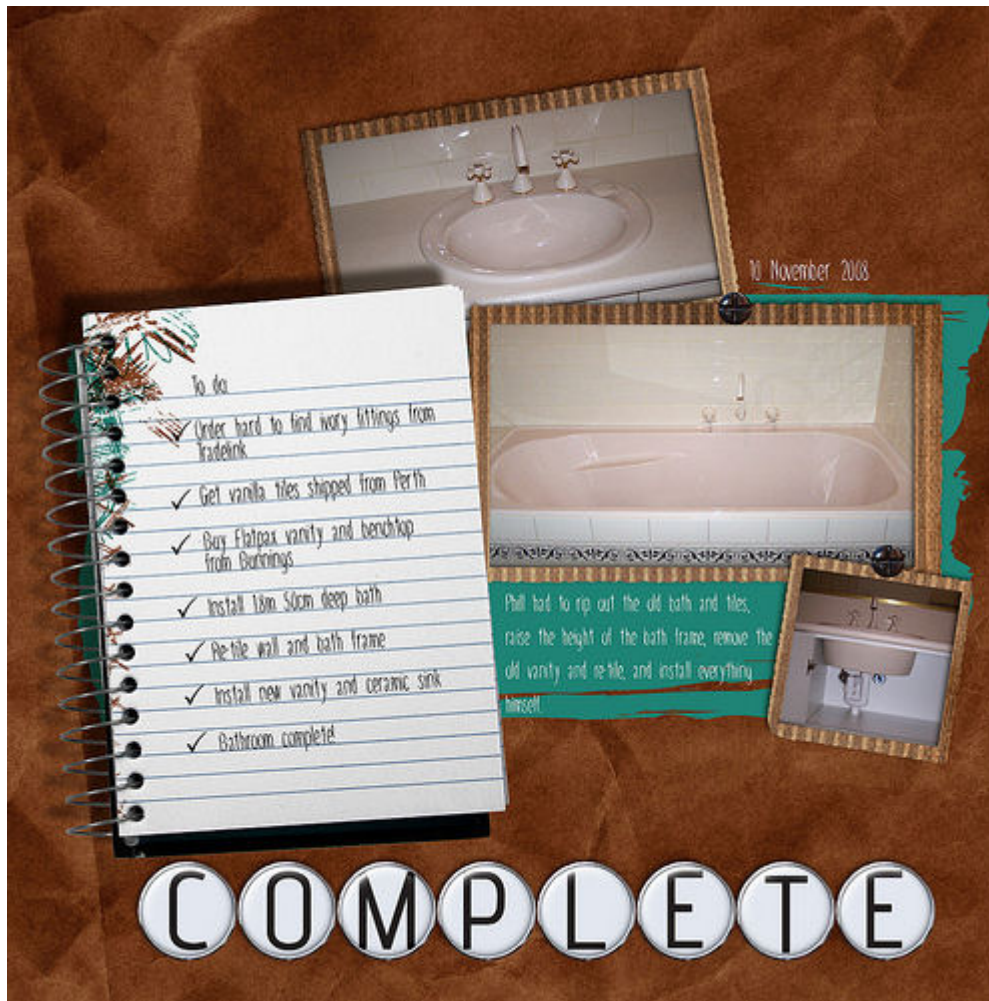
Layout by Melissa Shanhun