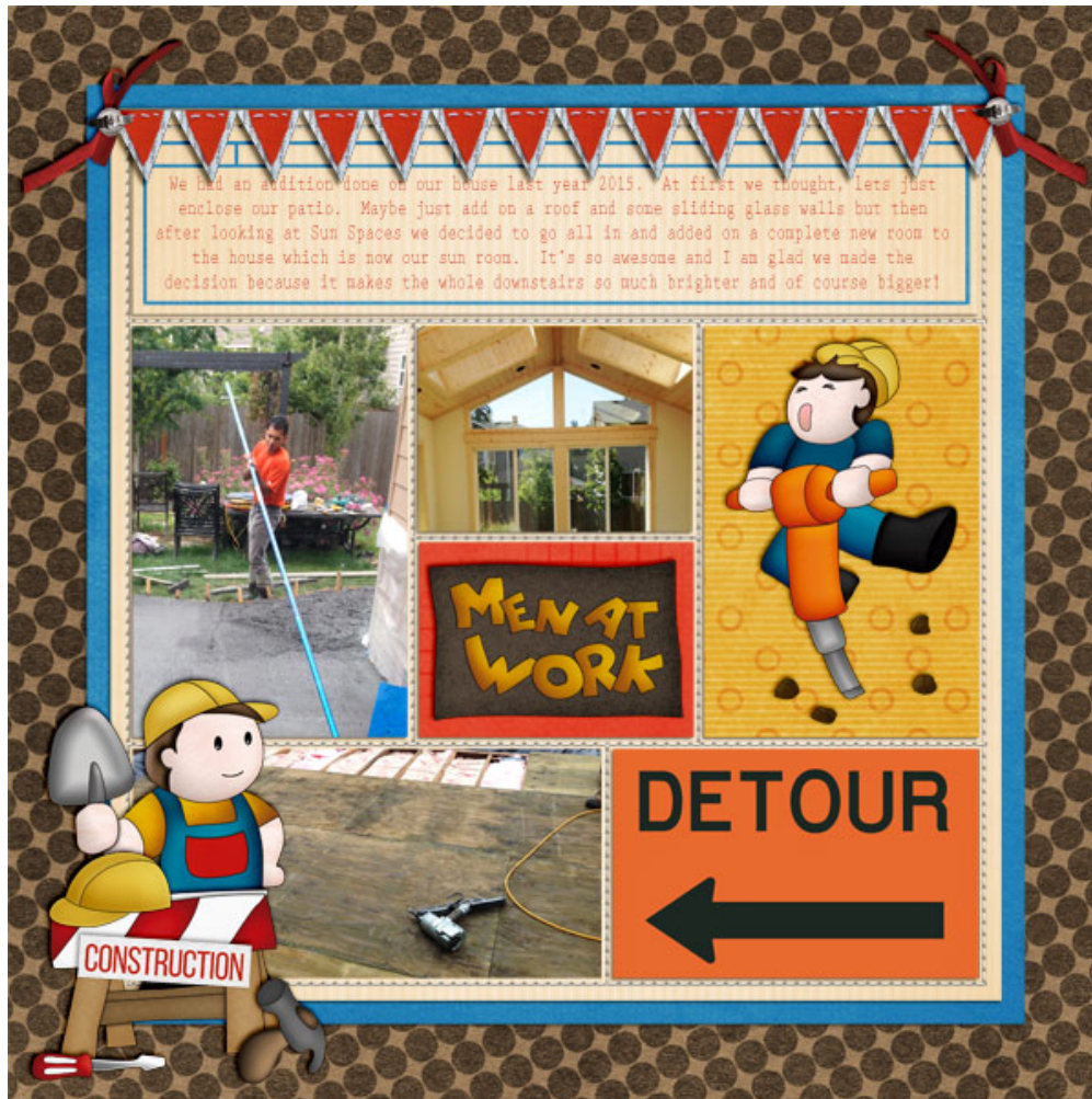
Layout by xboxmom