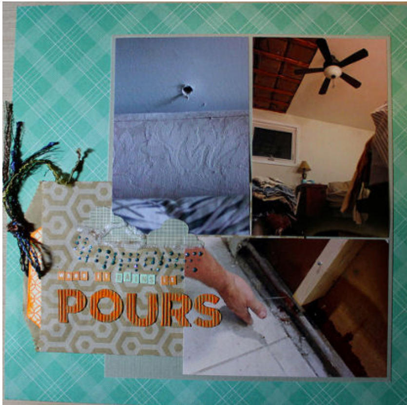
Layout by Heather Dubarry