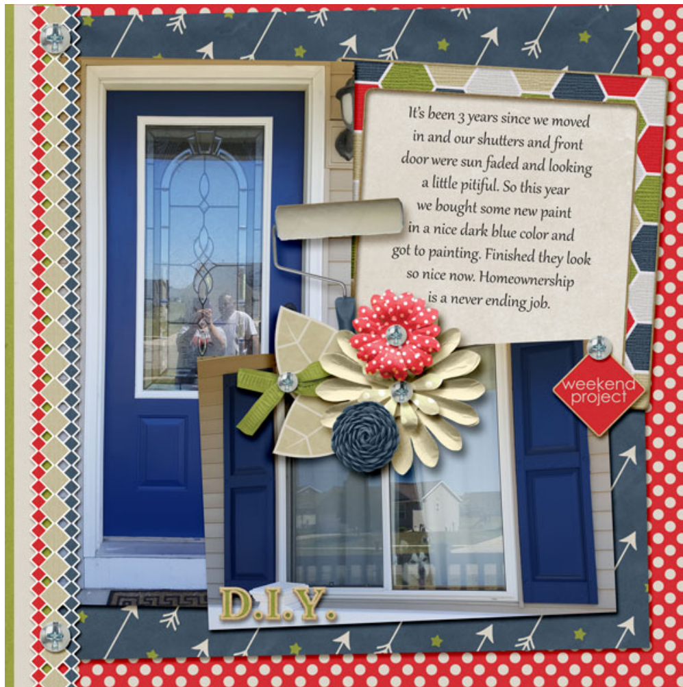
Layout by Kiana