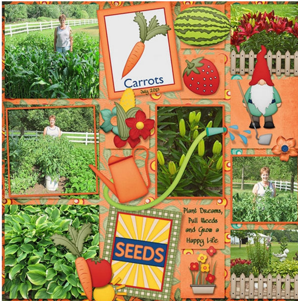
Layout by Joyce Korenuk