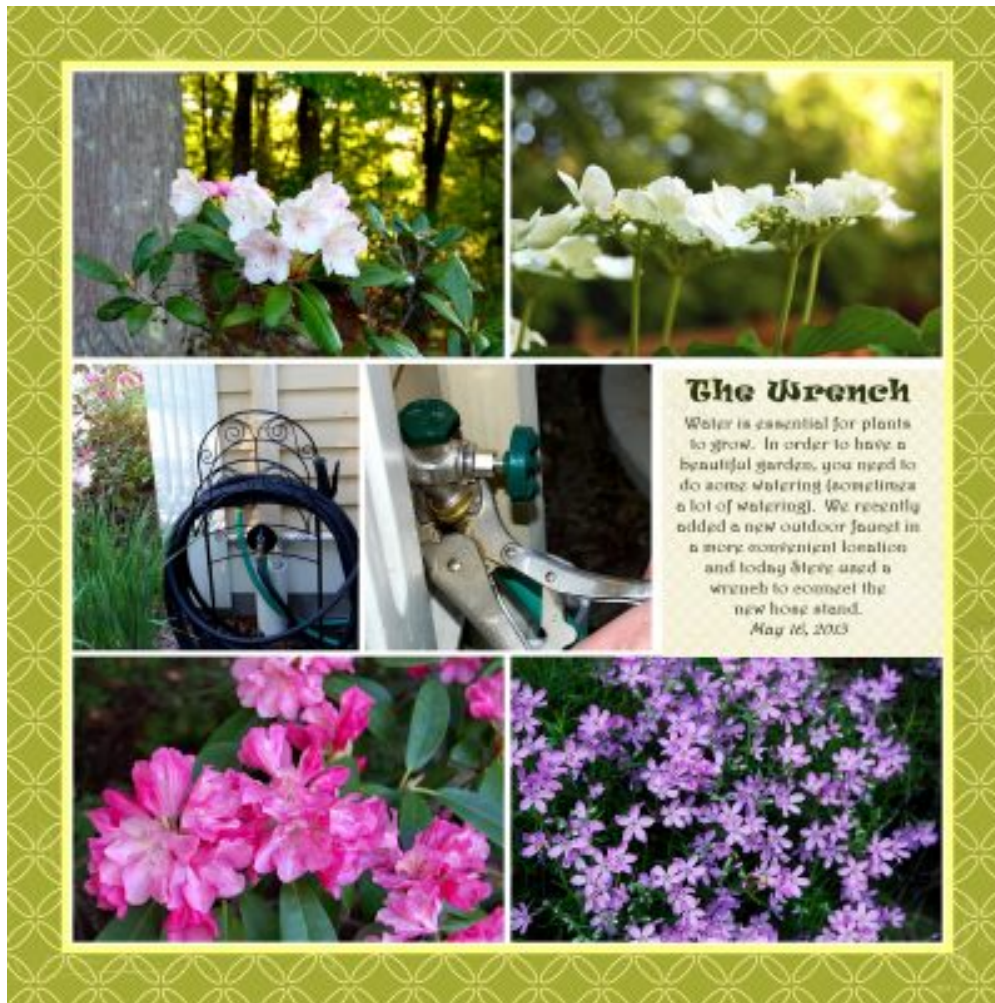
Layout by Diane Campbell