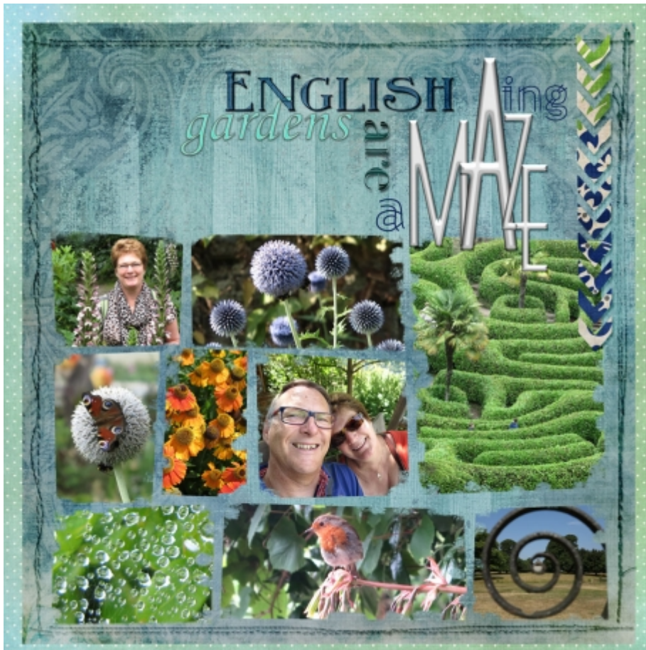
Layout by Lilian Jansen