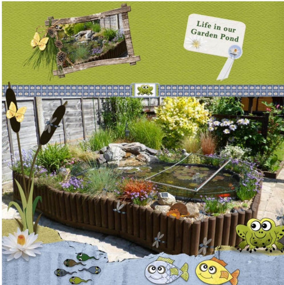
Layout by Chris Allport