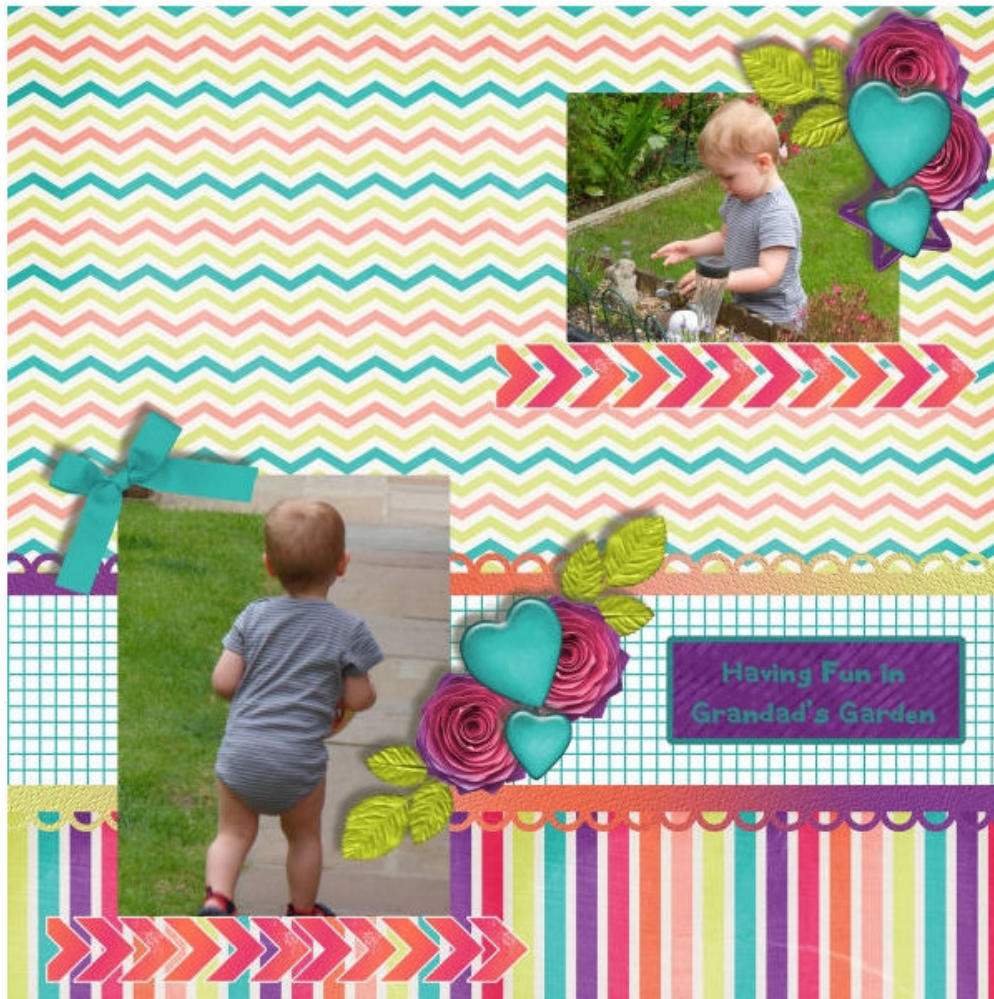
Layout by Chris Allport