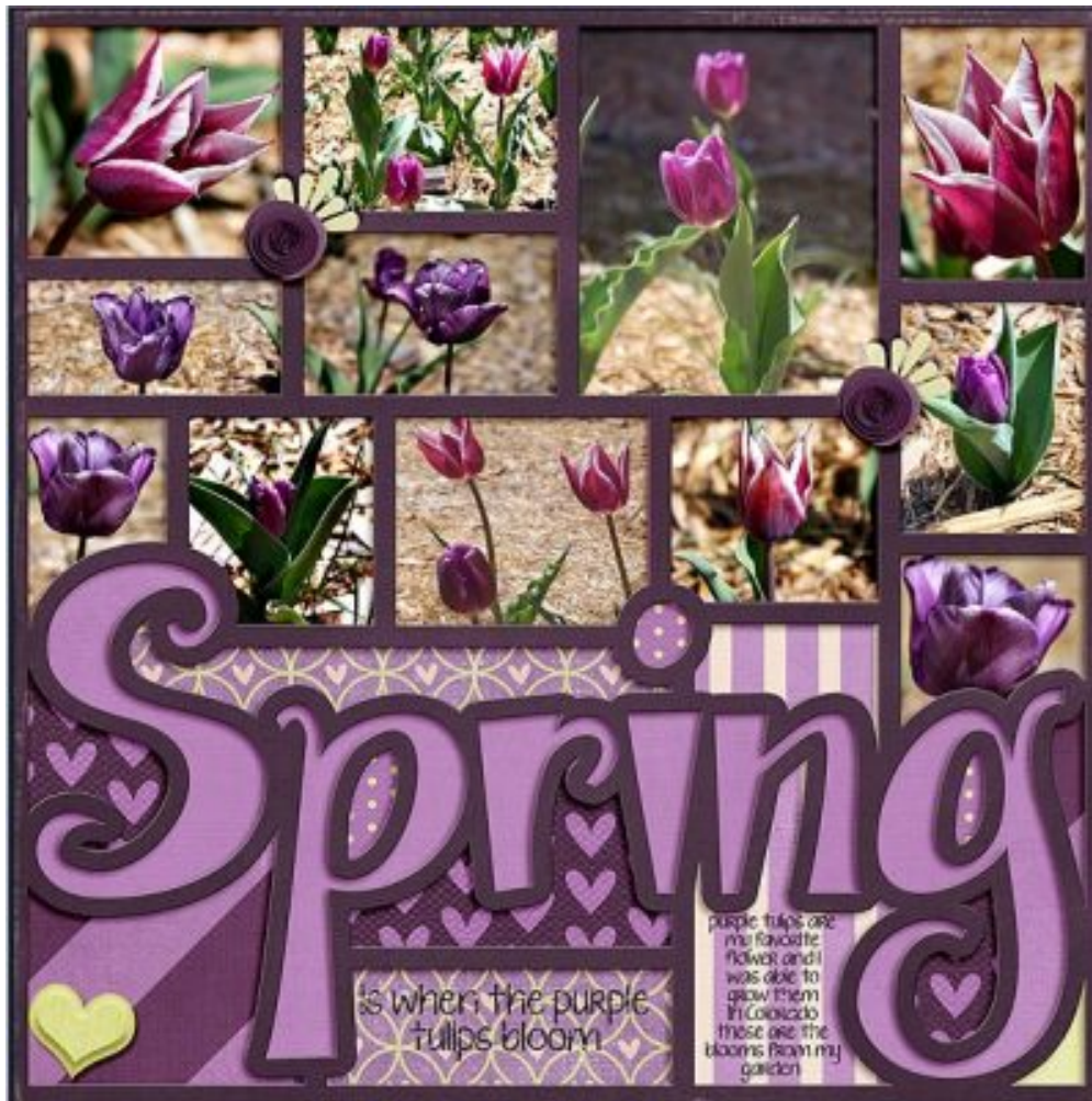
Layout by Shellby Joslin