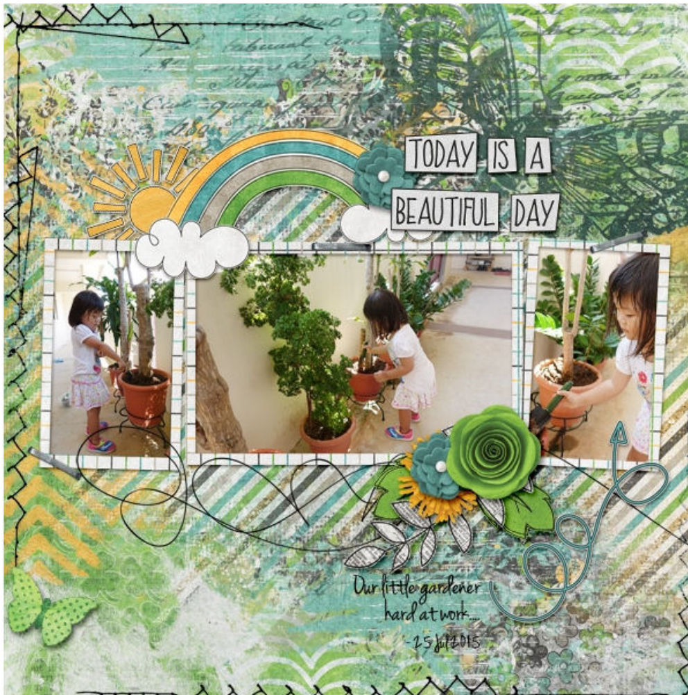
Layout by Fiona Lee

Of course, kids in the garden does not ALWAYS mean helpful presence. Sometimes, kids just love to look and play (and maybe sometimes, pick something they shouldn't?). But you will always have the smile of a child discovering something in that garden.