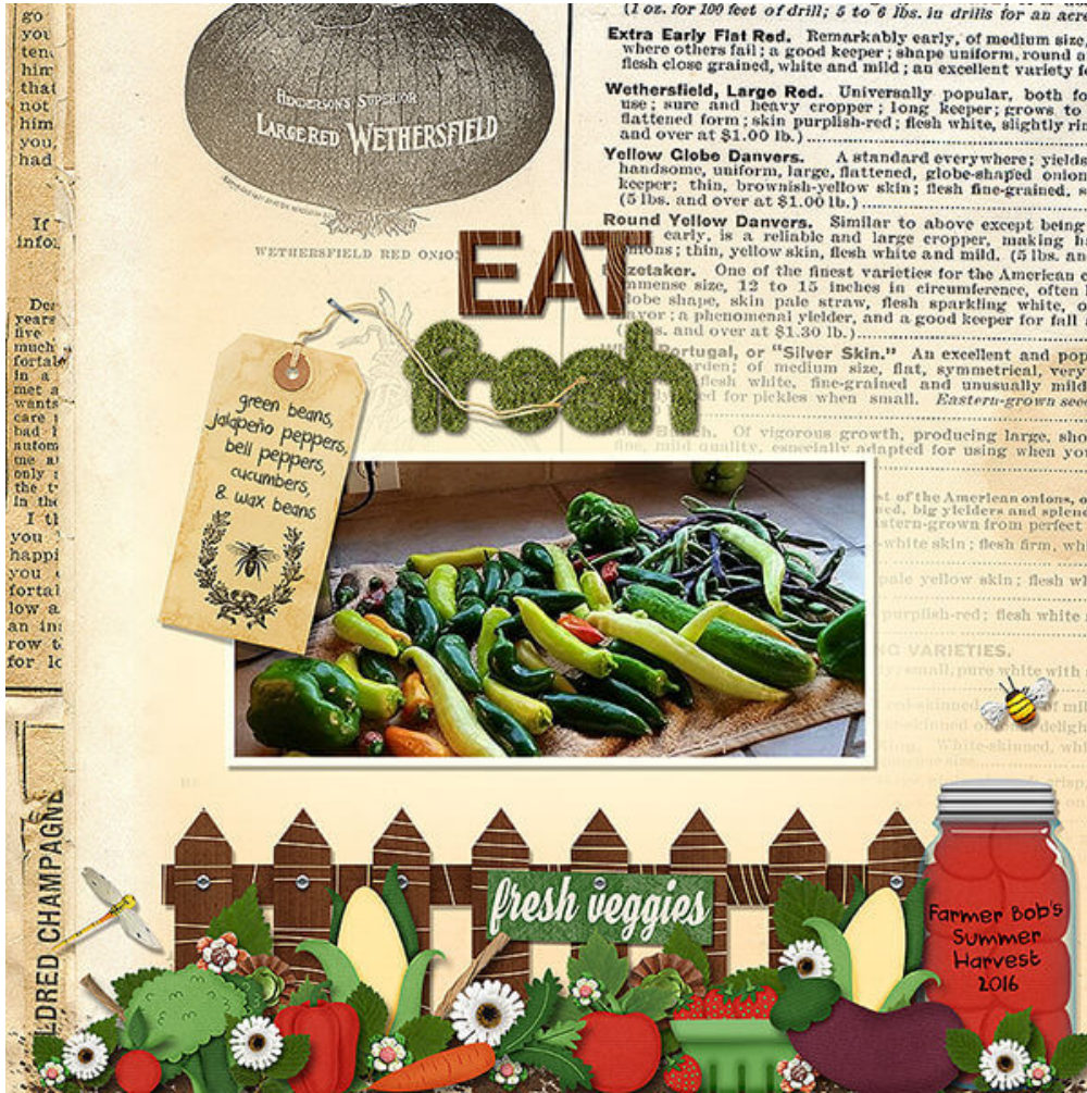
Layout from FJChickie