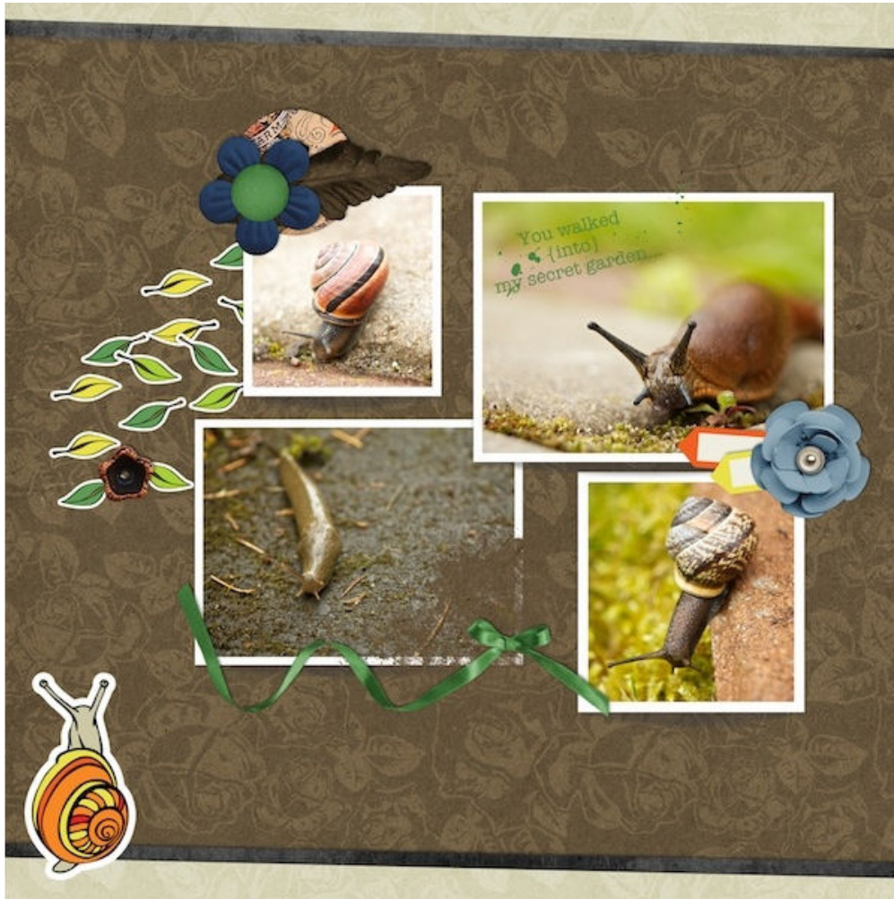
Layout by Ania Archer