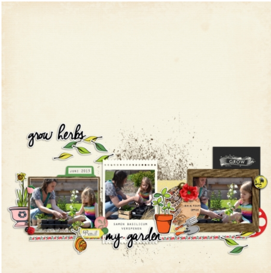
Layout by Melo Vrijhof