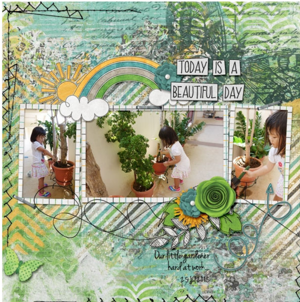
Layout by Fiona Lee

Of course, kids in the garden does not ALWAYS mean helpful presence. Sometimes, kids just love to look and play (and maybe sometimes, pick something they shouldn't?). But you will always have the smile of a child discovering something in that garden.