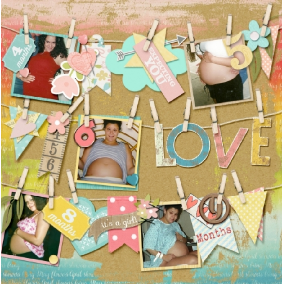
Layout by Melanie Nutile