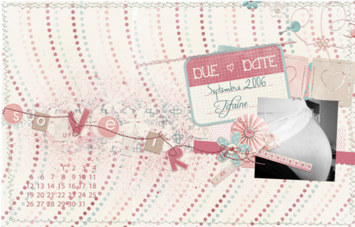
Layout by mag.azeline