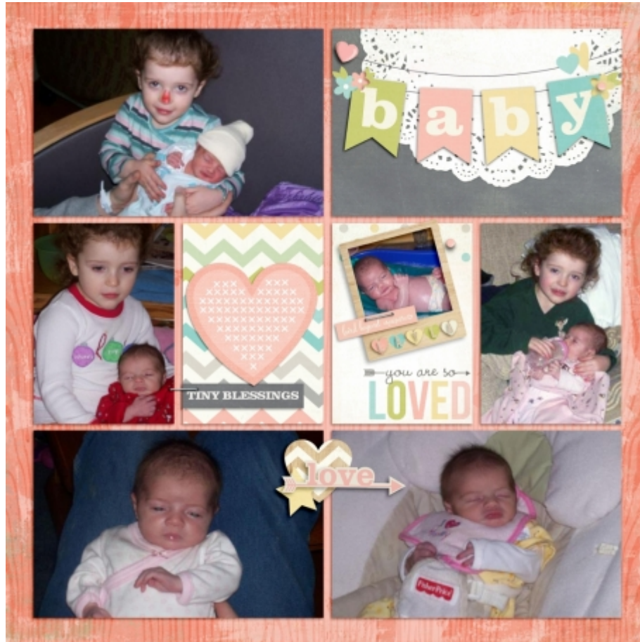
Layout by Melanie Nutile