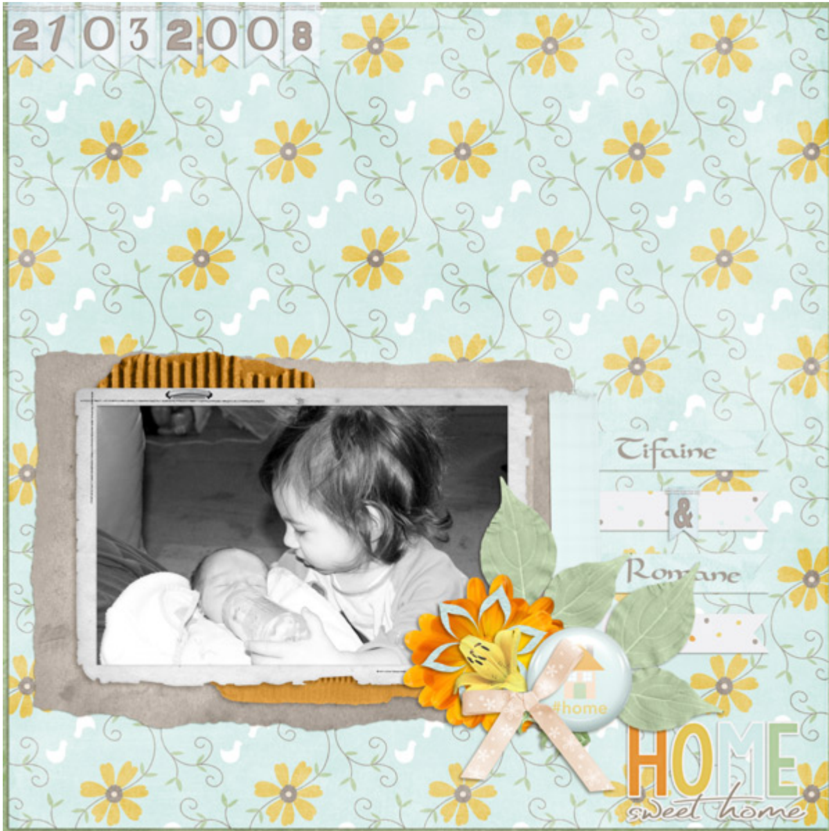
Layout by mag.azeline