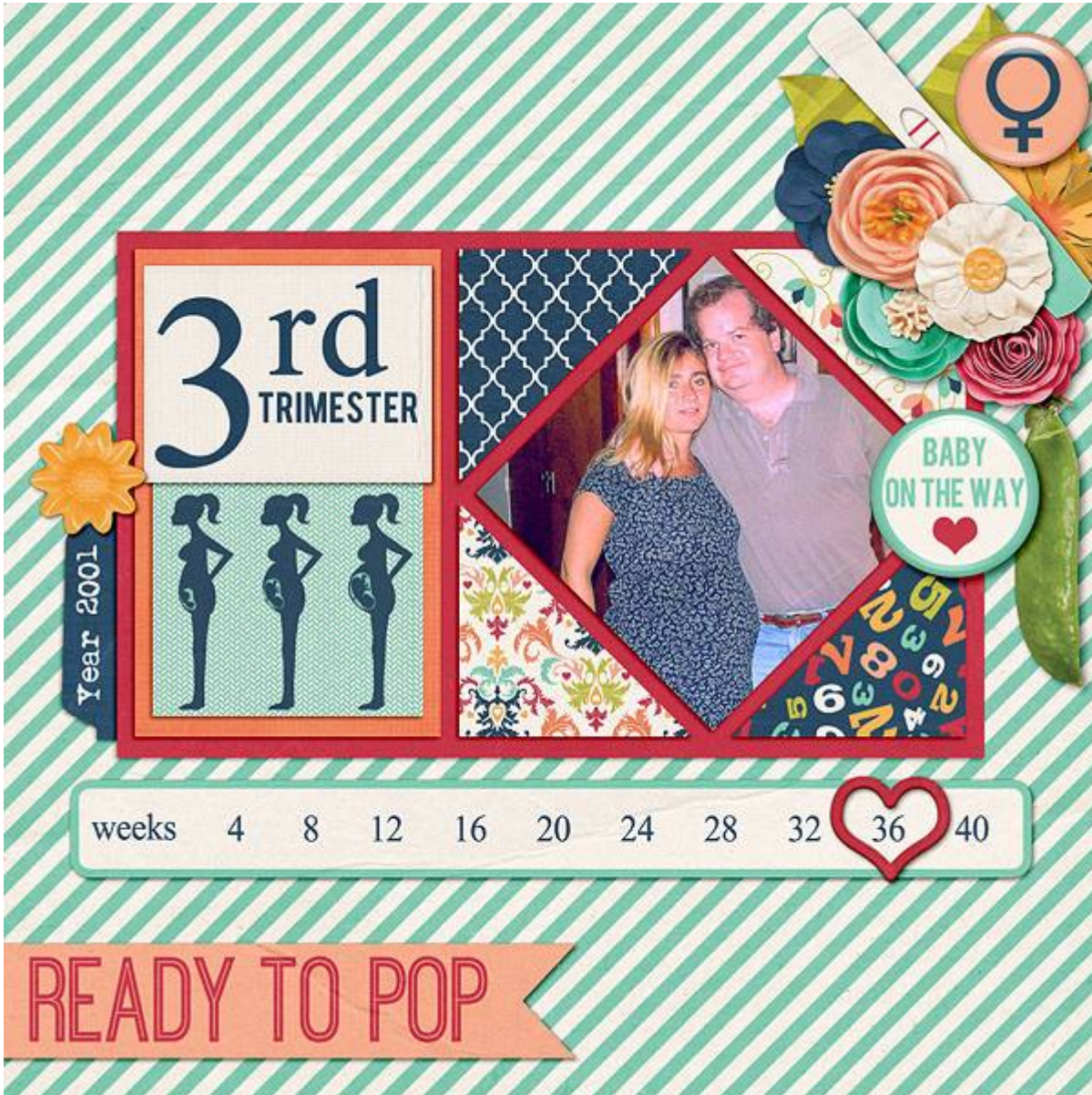
Layout by marinapj