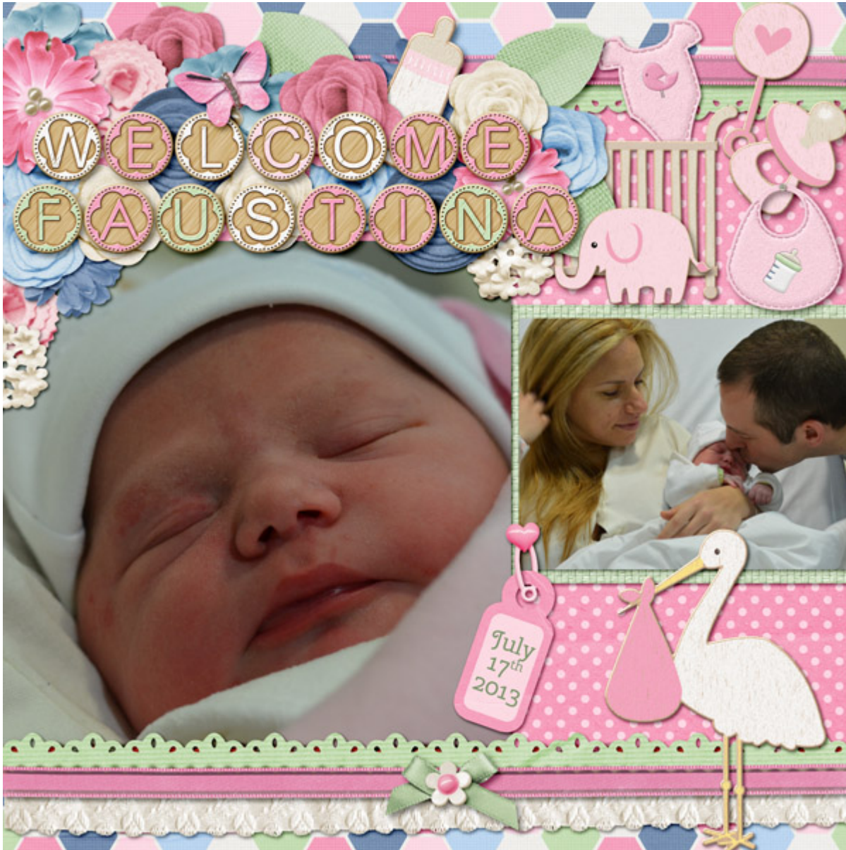
Layouts above by Â marinapj