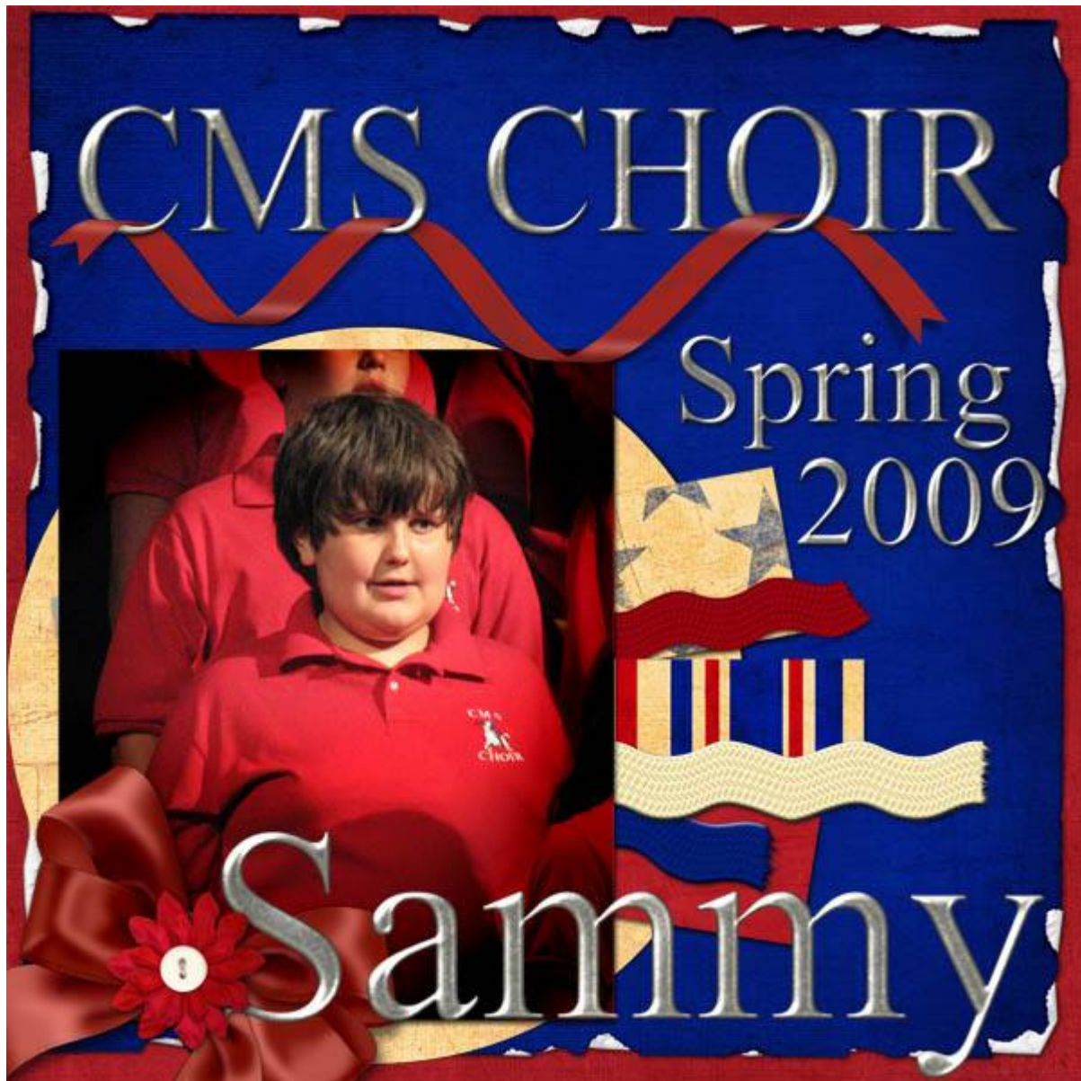
Layout from Jennifer White