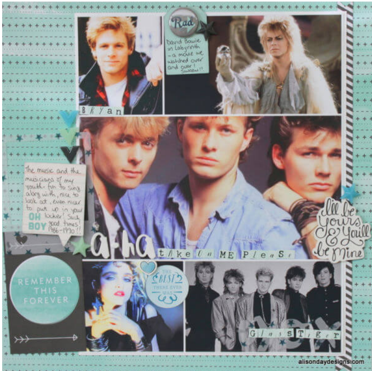
Layout from Alison Day

Do you have scrapbook projects to showcase some musical theme? Leave a comment below and link to your layout or feel free to tell the story. Remember, you can document stories without photos!