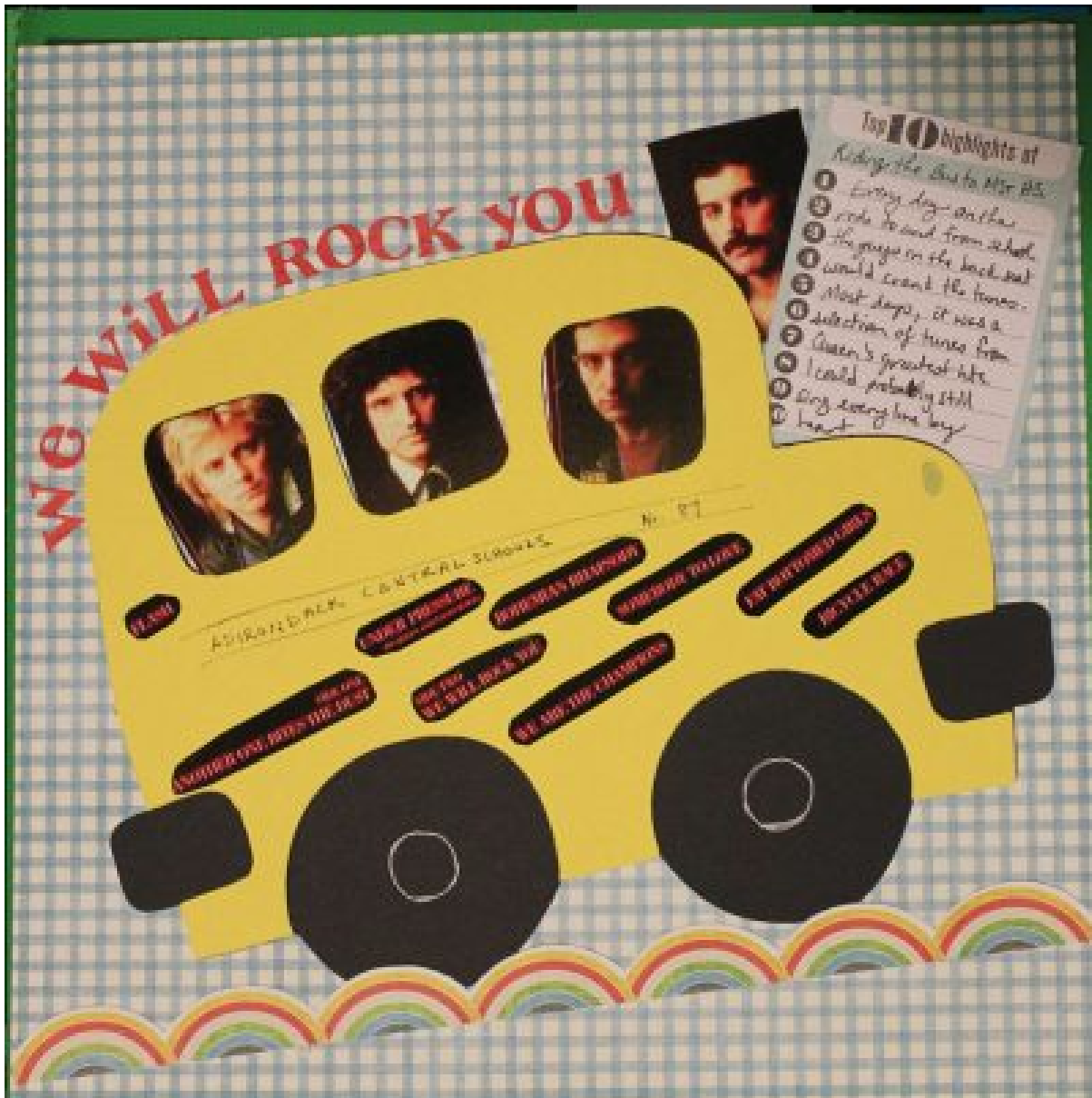
Layout from Heather