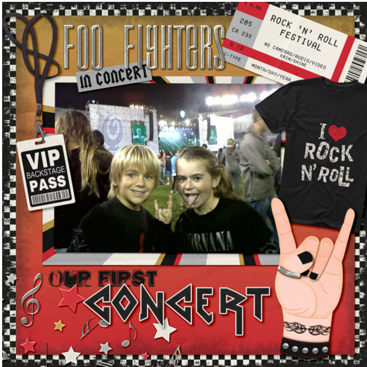
Layout from Marina