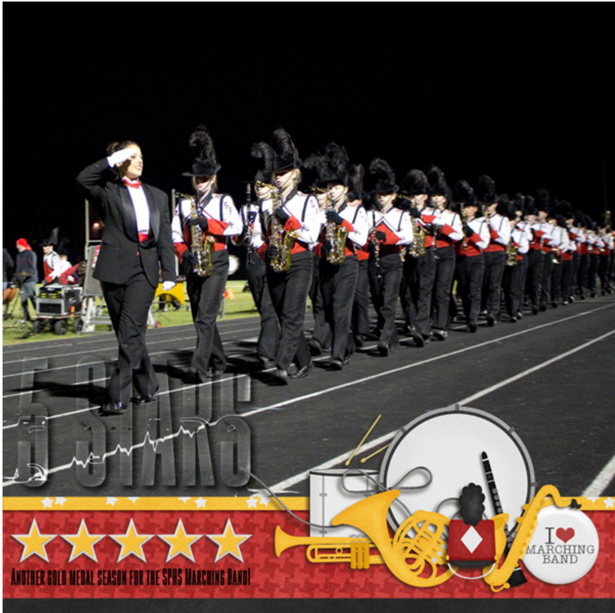
Layout from Lori