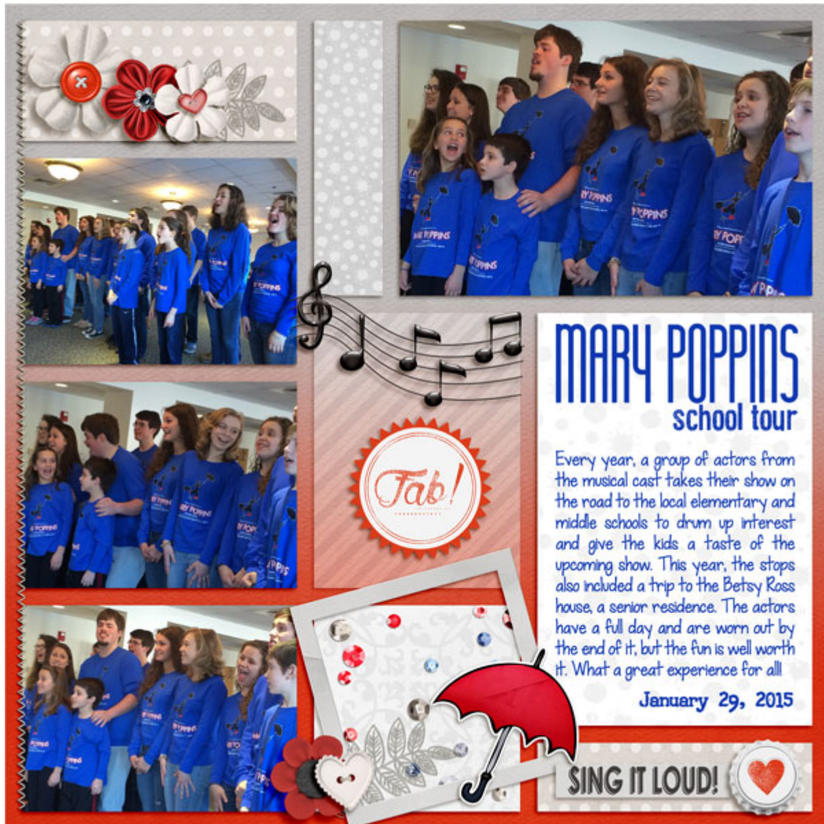
Layout from Lori