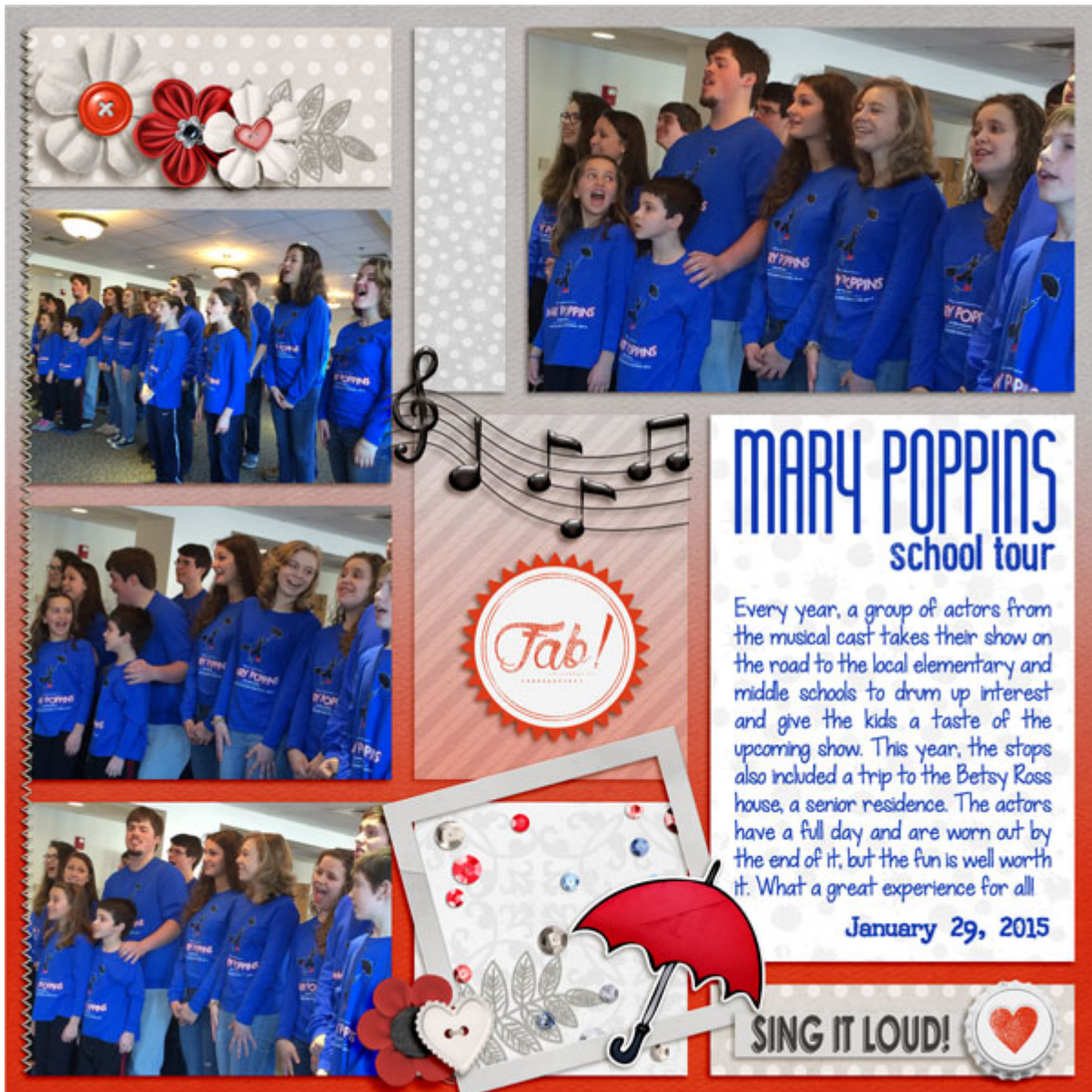
Layout from Lori