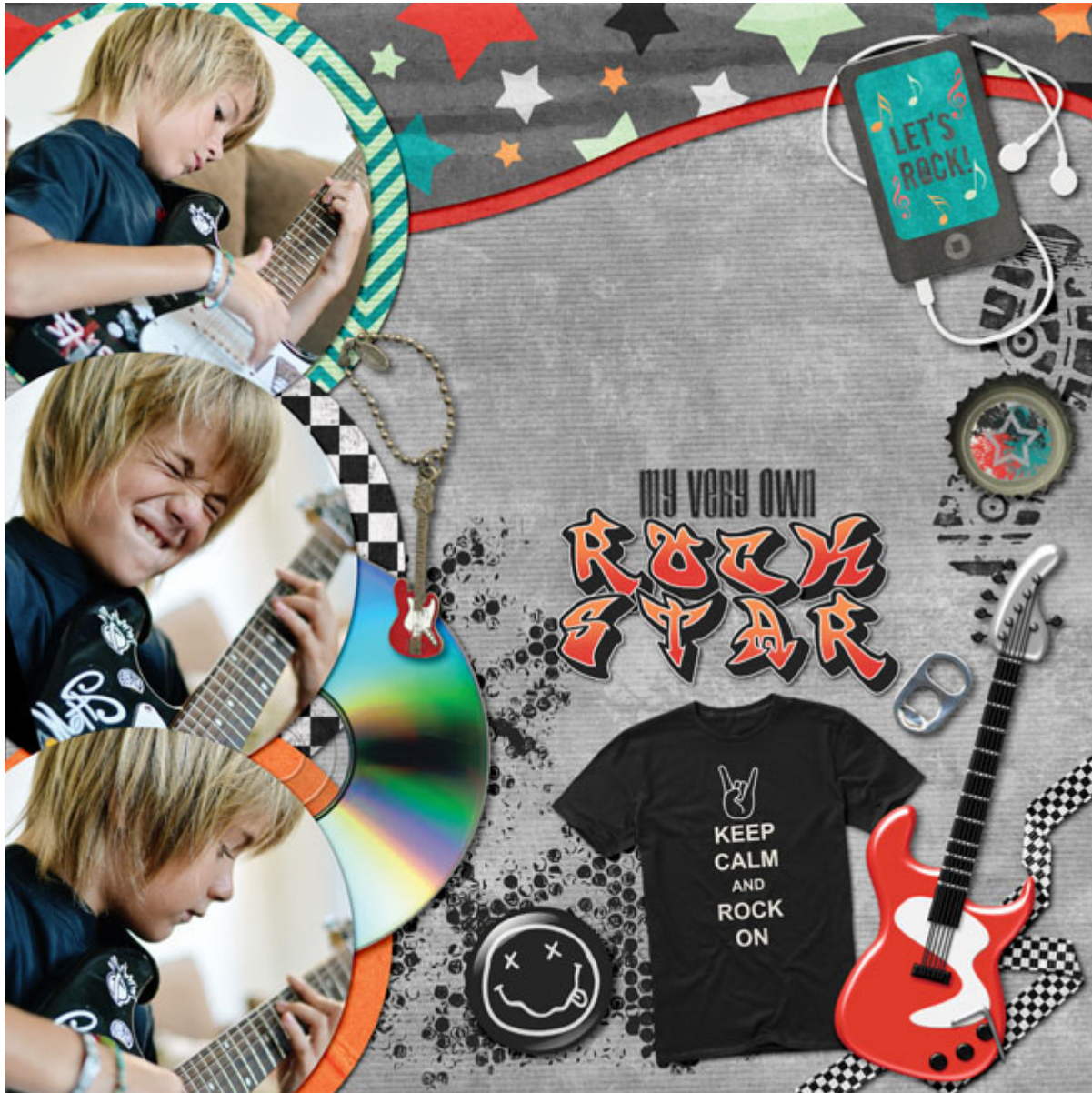
Layout from Marina