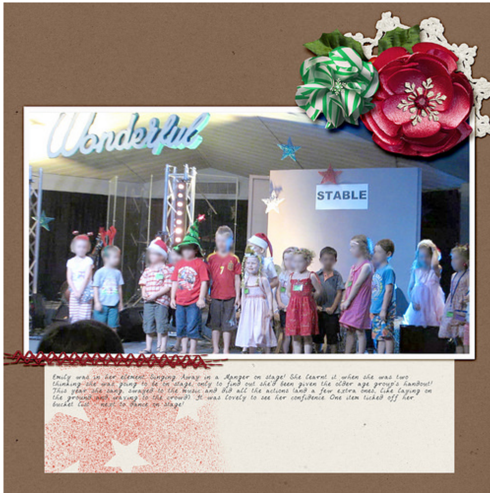
Layout from Melissa Shanhun