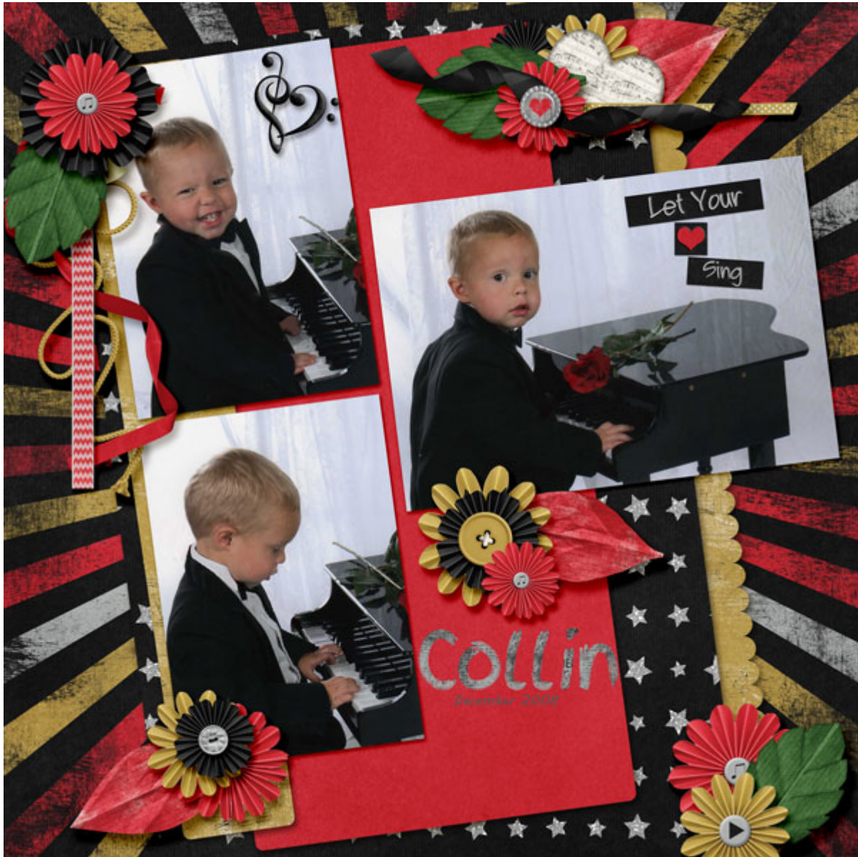
Layout from Alquafea