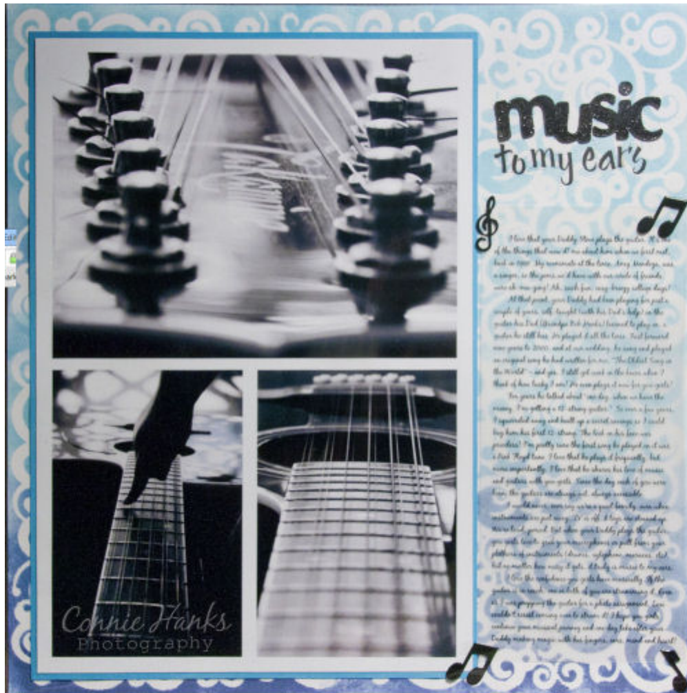
Layout from Connie Hanks