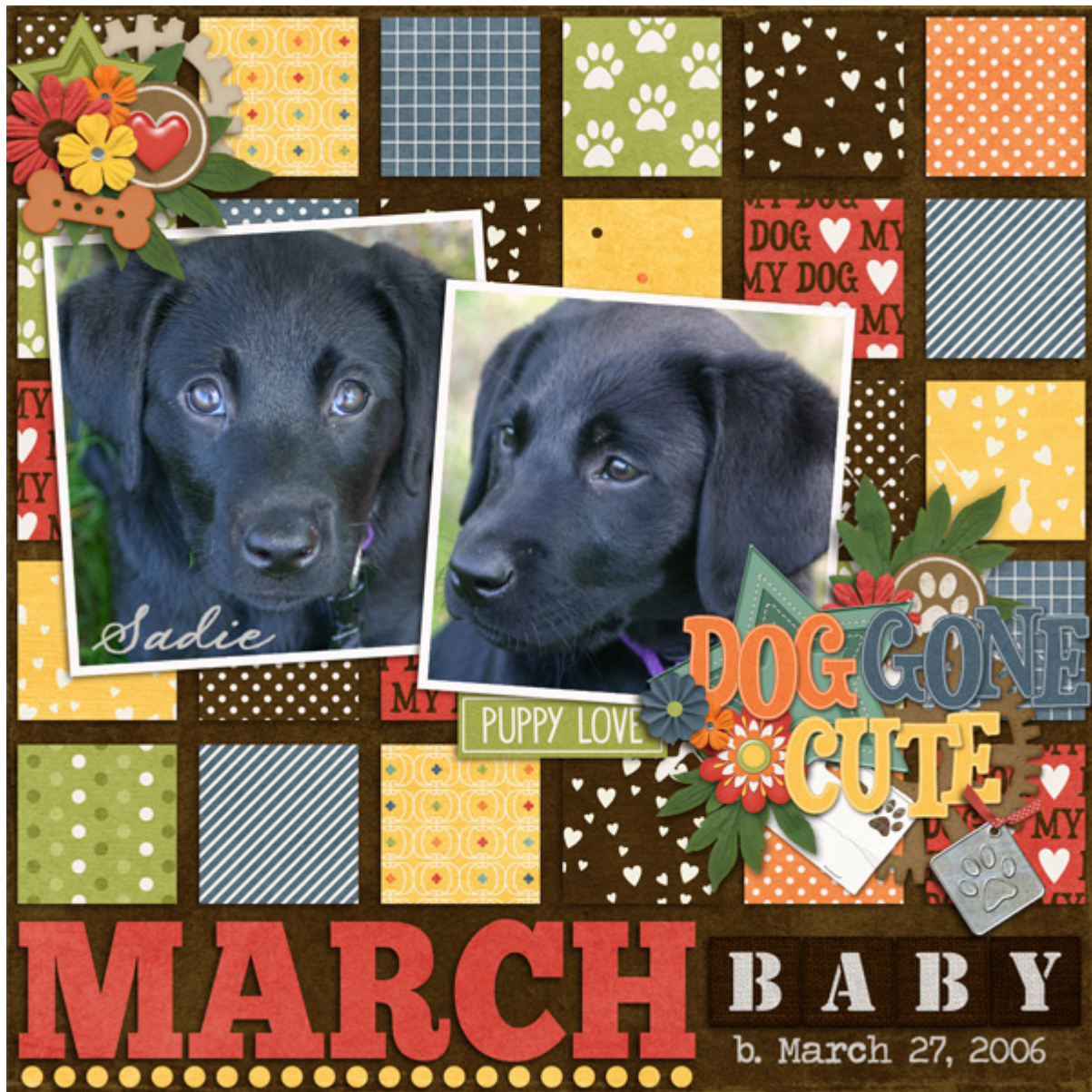
Layout by Lori

Is your son or daughter interacting with your dog? Or maybe it is the other way around? This is often a marvelous time for them to bound (and for you to snap a picture).