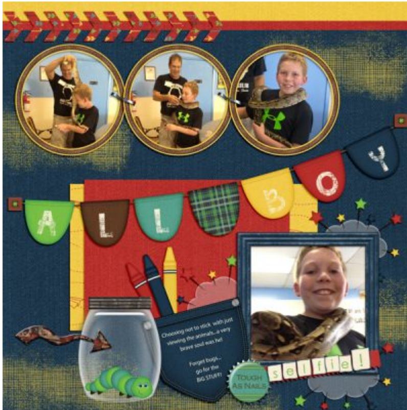
Layout by msbrad

What other types of pets do you have? I have a friend who has a pot belly pig as a pet, and she says it is quite friendly. How about bunnies? Even squirrels? Different pets have different needs, but will be stories that you can document and share in a scrapbook page. Go ahead. Share those stories.