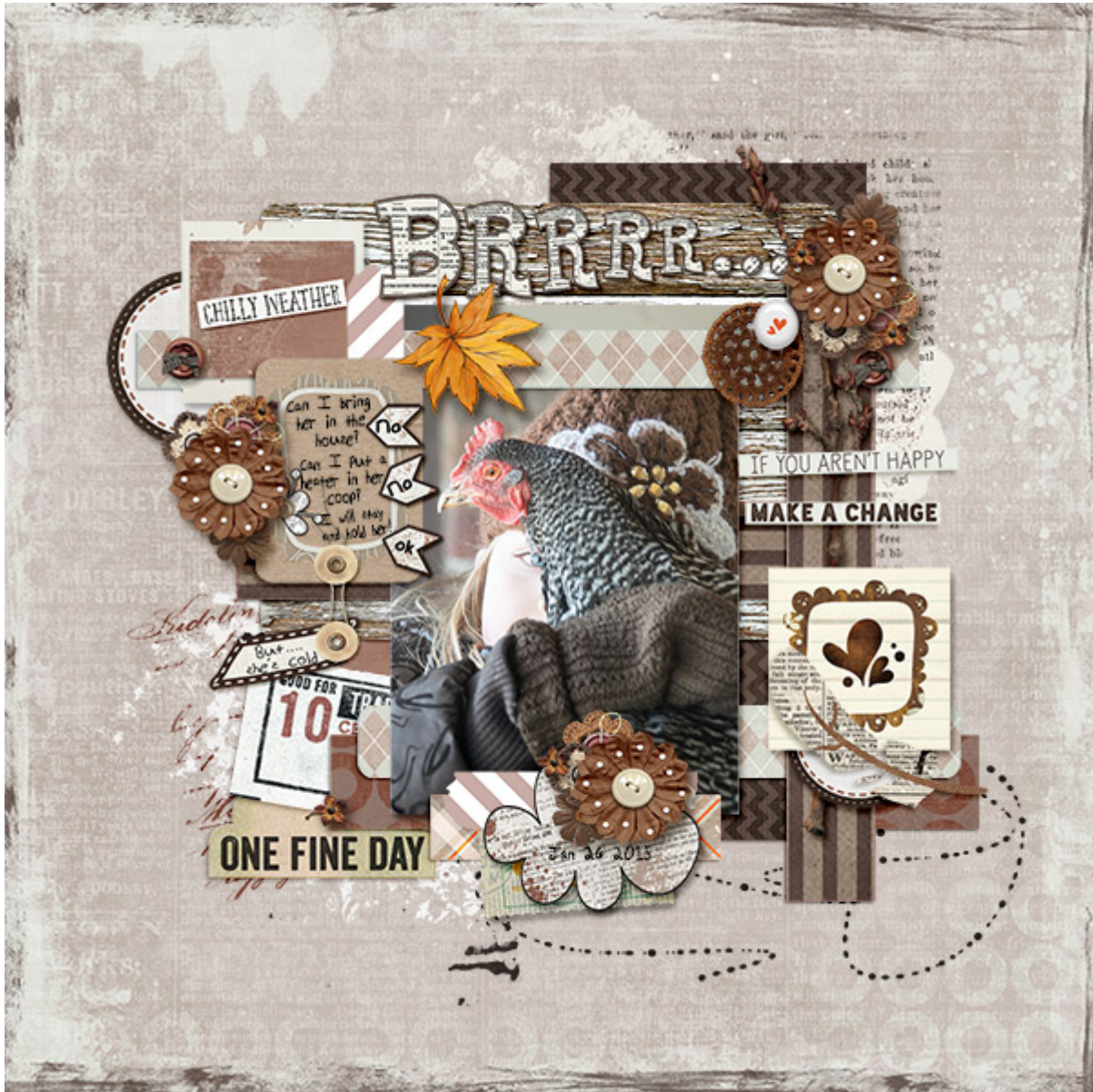
Layout by scrappingramma