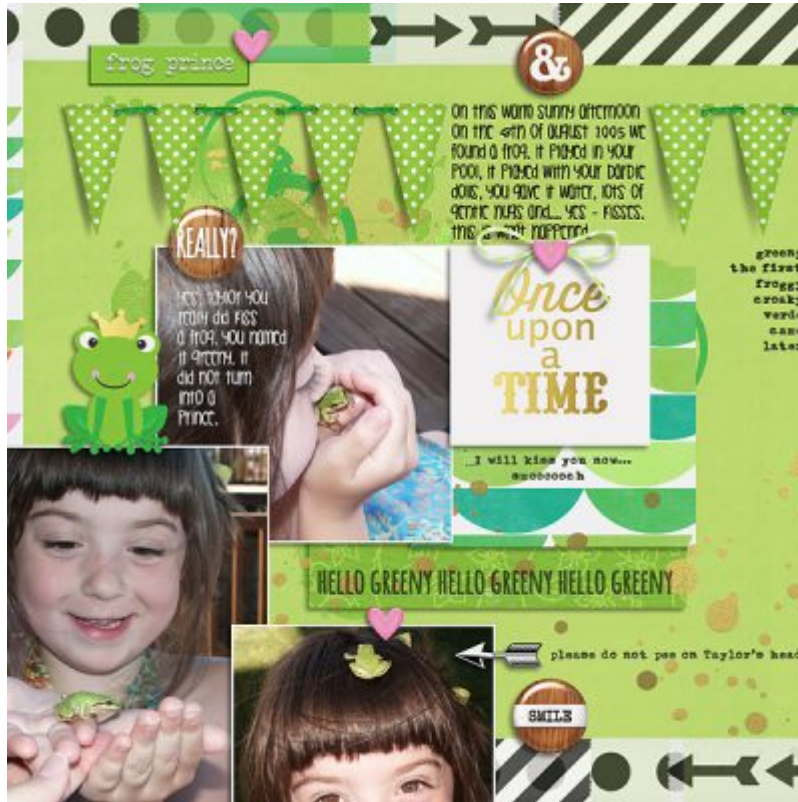
Layout by Tracey Monette