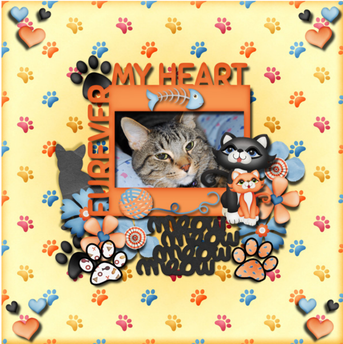
Layout by windswept