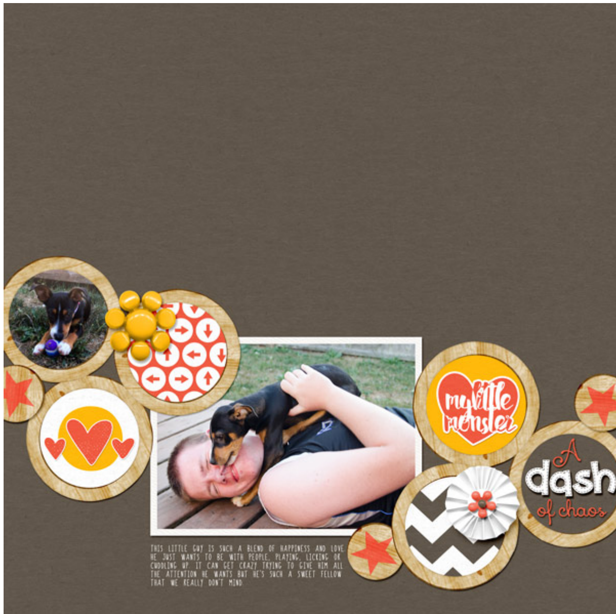
Layout by Annette