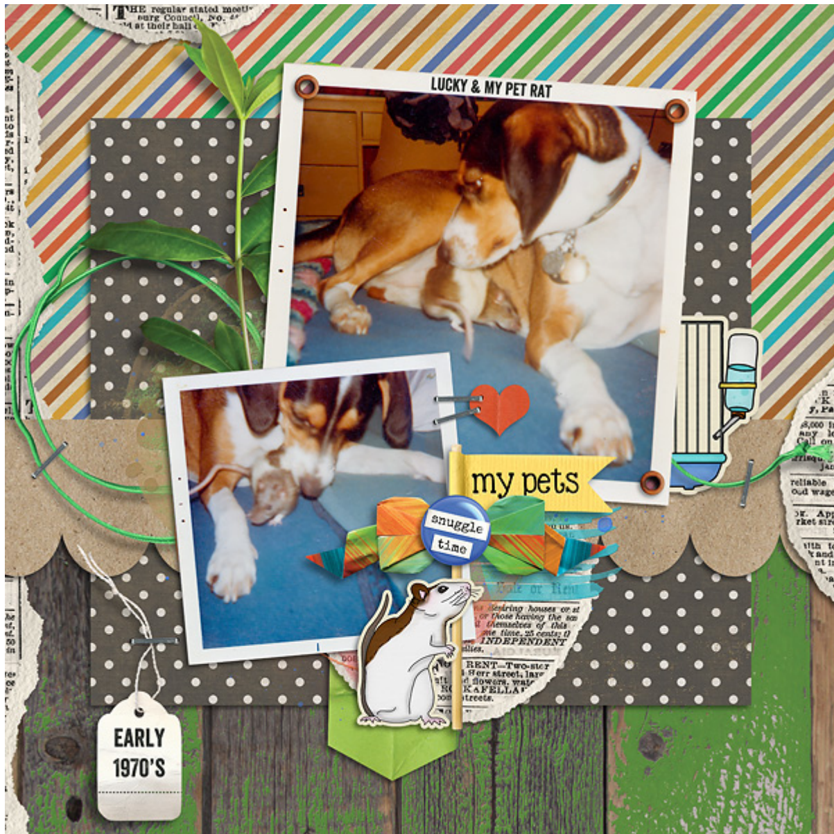
Layout by Tracey Monette