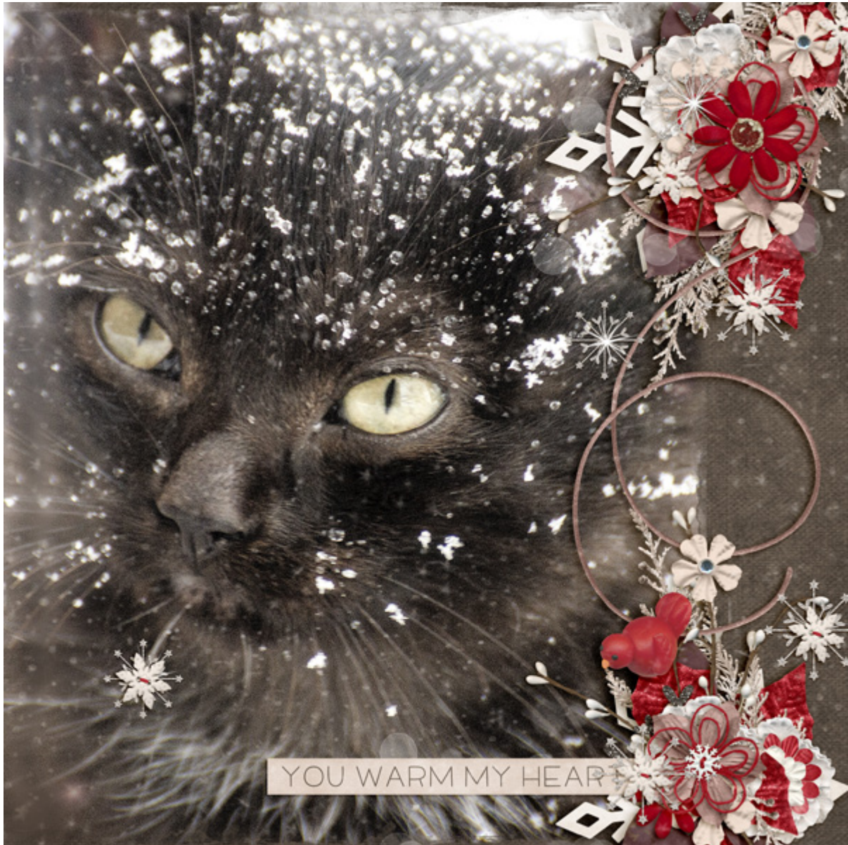
Layout from chili