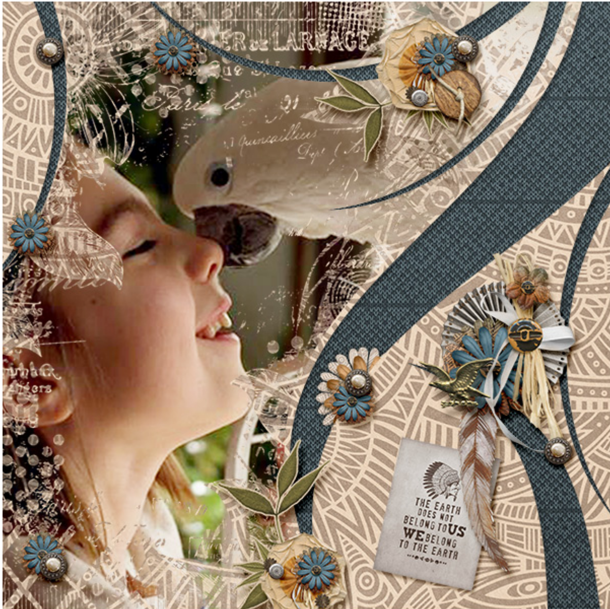
Layout from scrappingramma