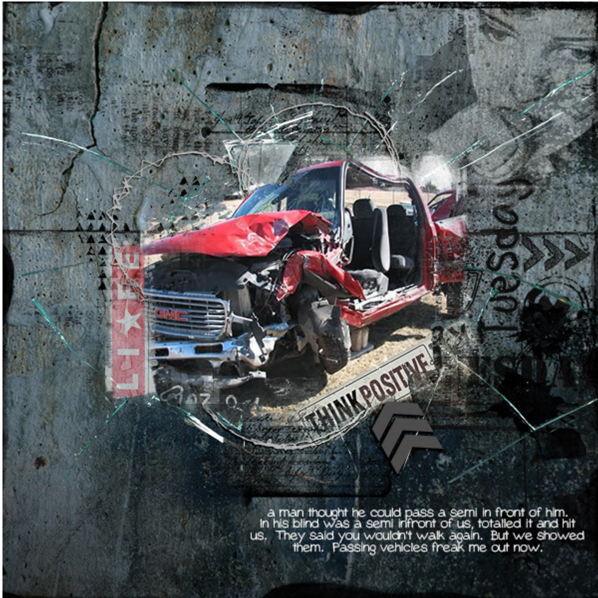
Layout from scrappingramma