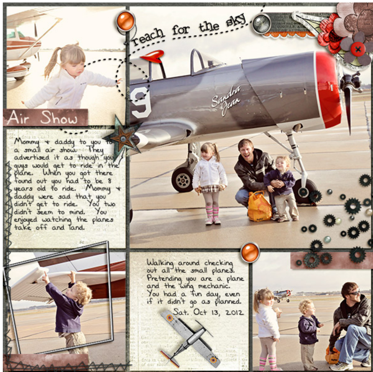
Layout by scrappingramma

But if you have the opportunity to document your first flight (or your child's), why not?