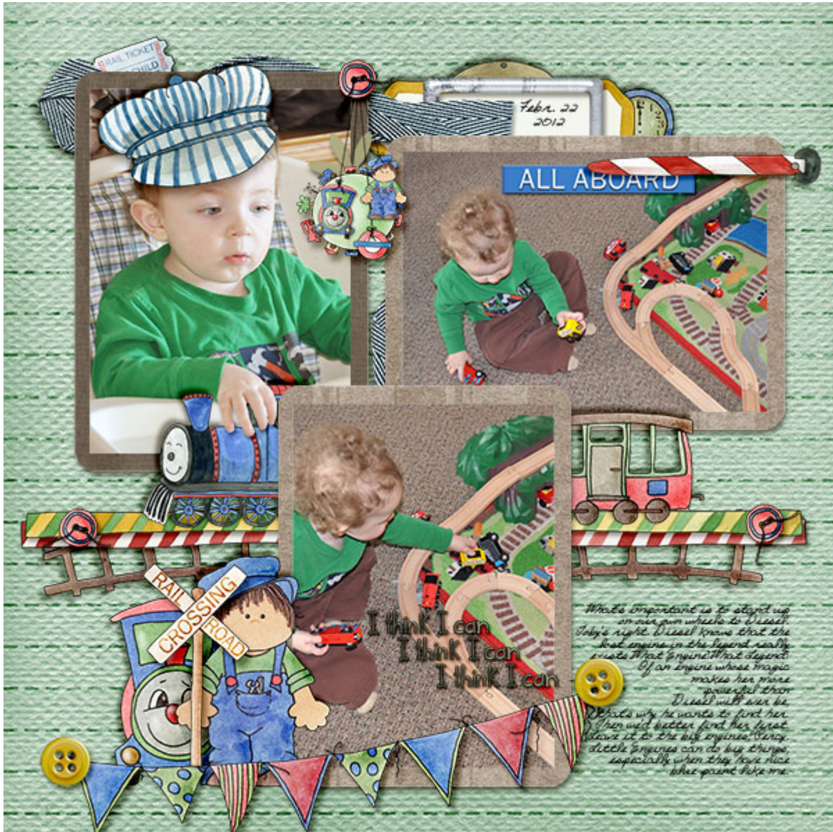
Layout from scrappingramma

Sometimes, however, some trains are just on display. Some adults are surely having fun creating those detailed replica using model trains.