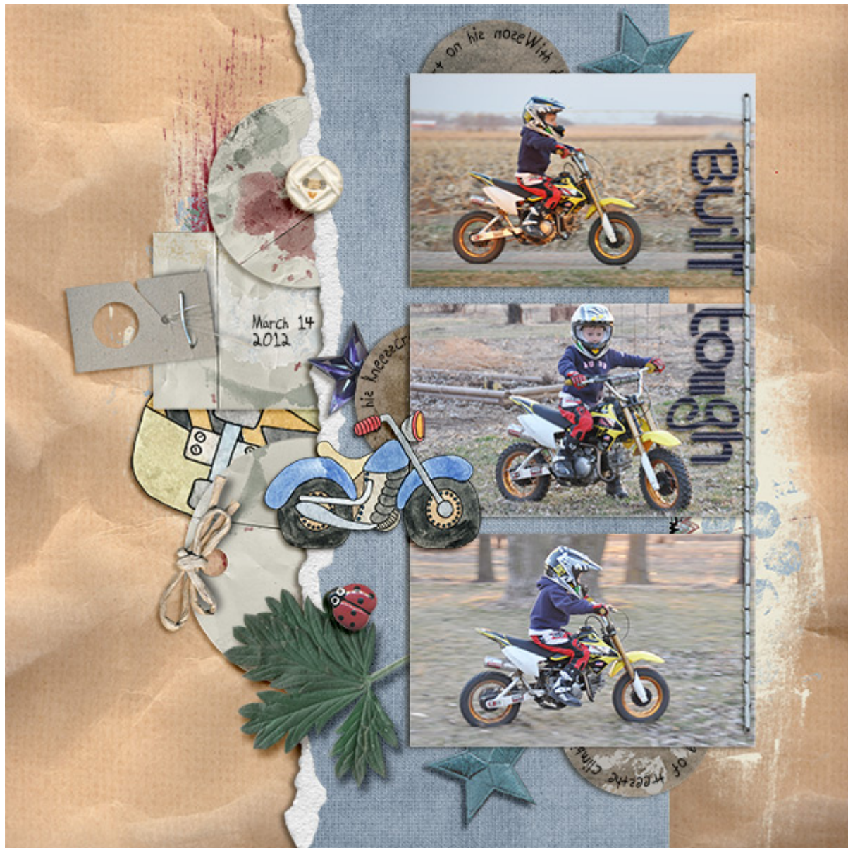
Layout from scrappingramma