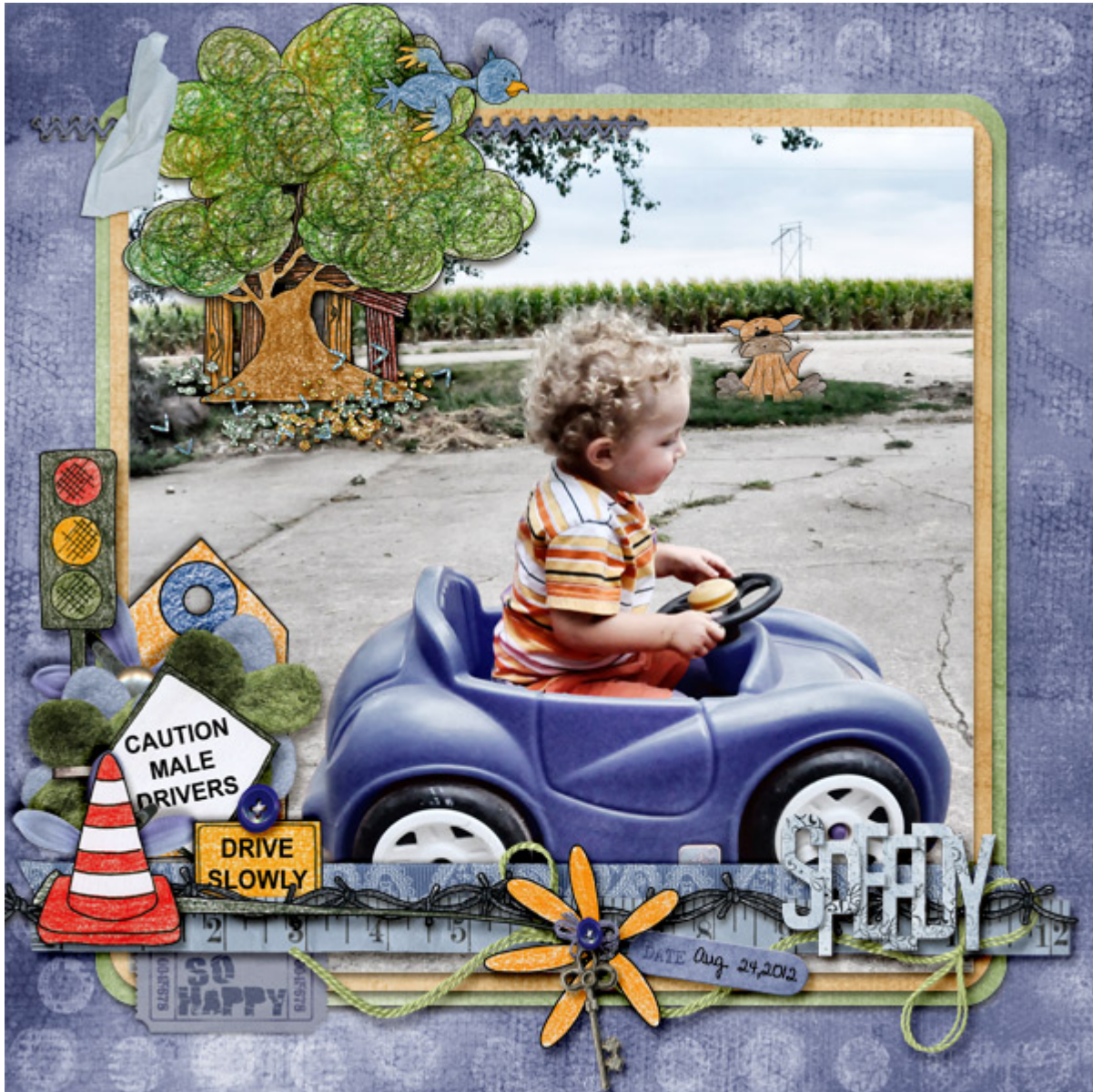
Layout by scrappingramma

But sometimes, accidents happen and a car crash is never a funny thing. Although, if you document and write about it, it should serve as a warning for friends and family members to always drive safely.