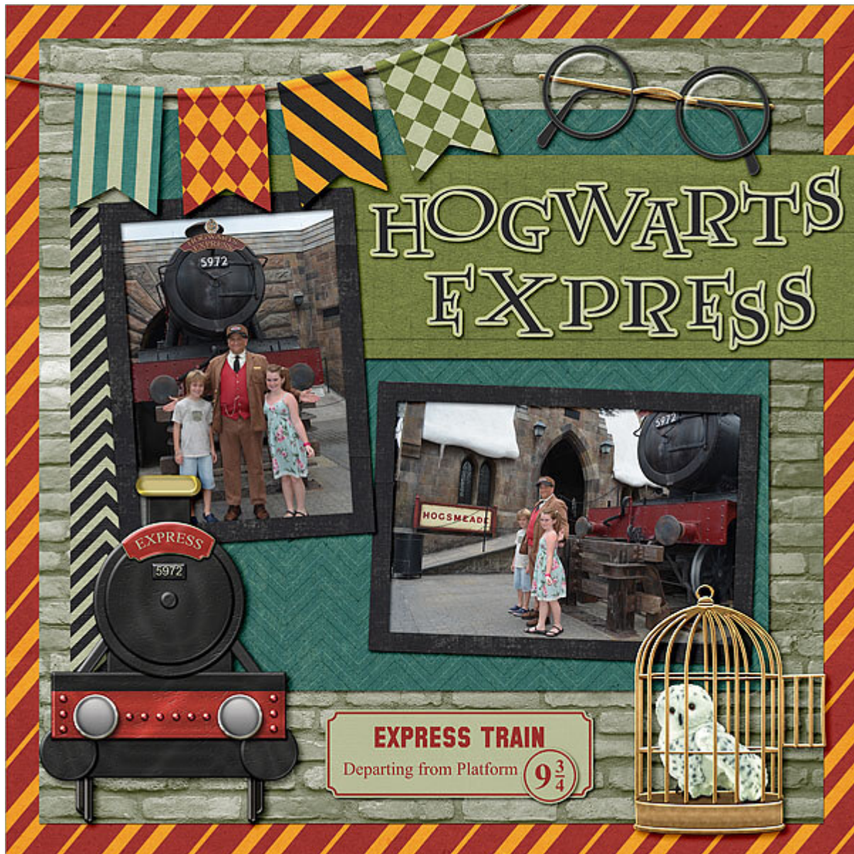
Layout from marnapj