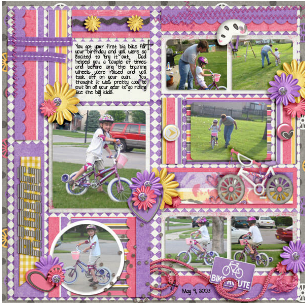
Layout from scrappingramma