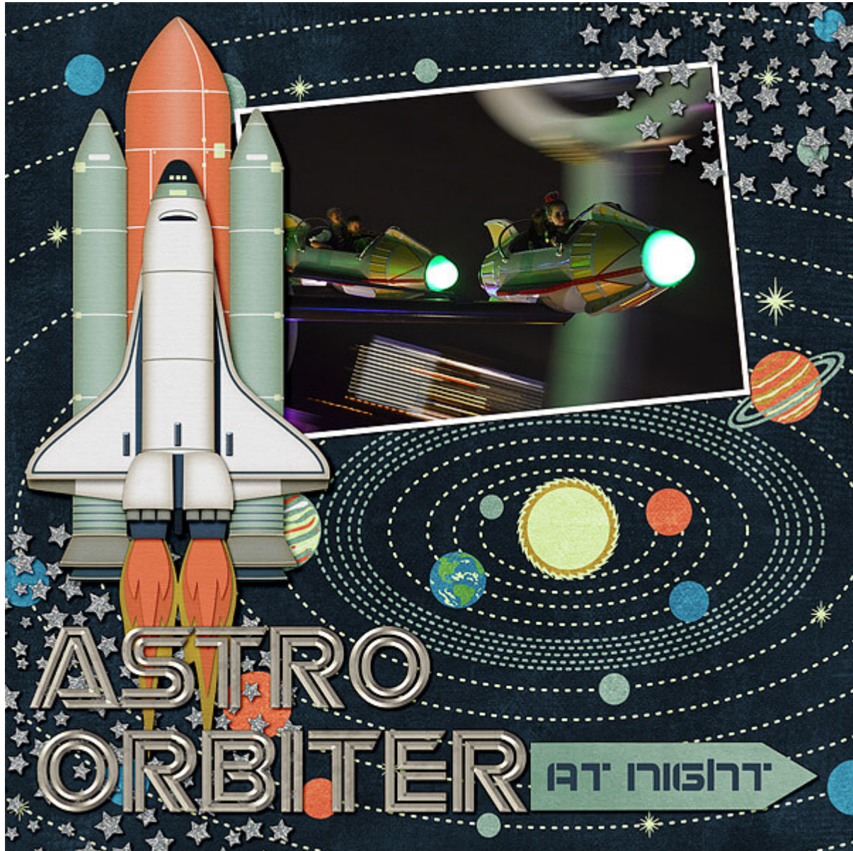
Layout by marinapj