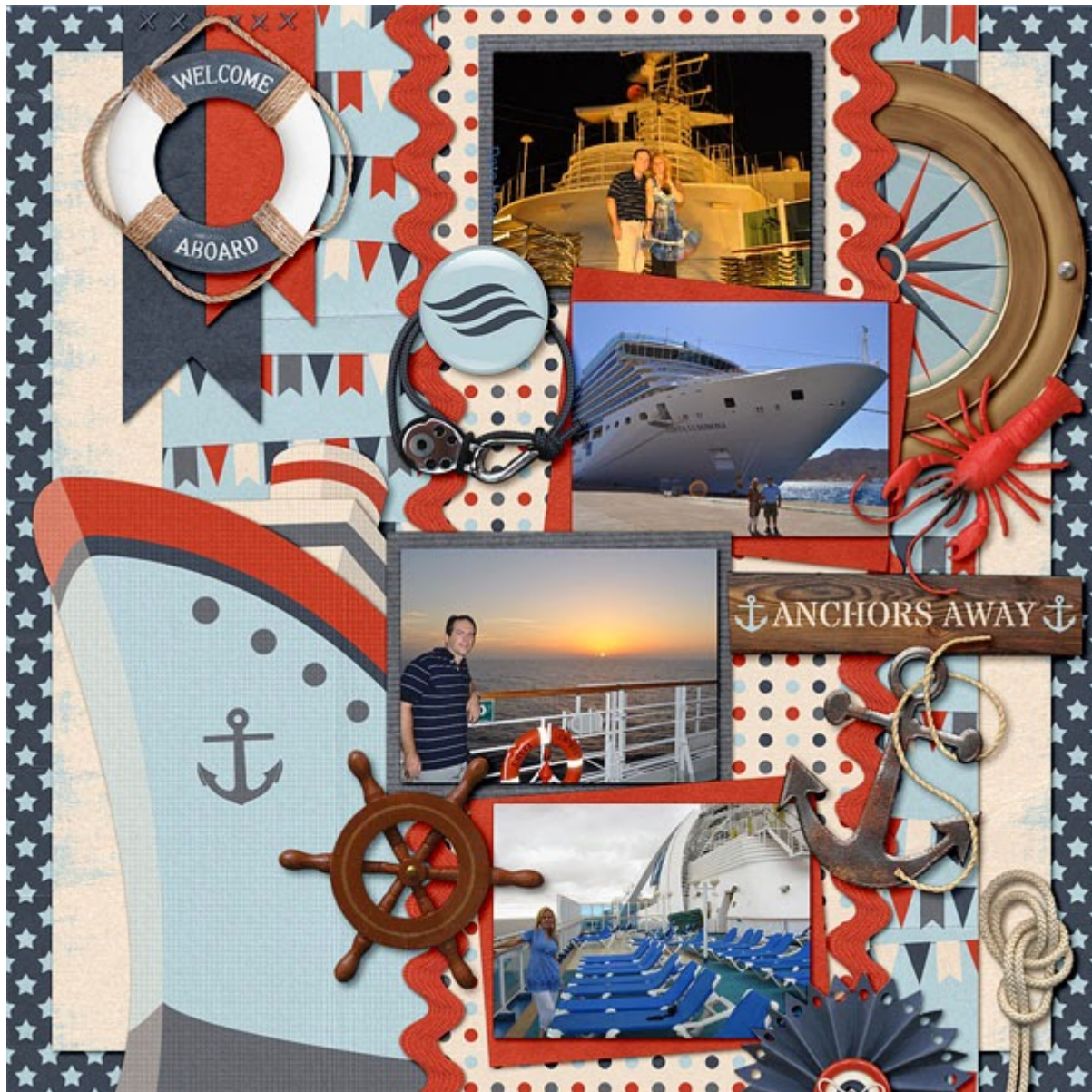
Layout by marinapj