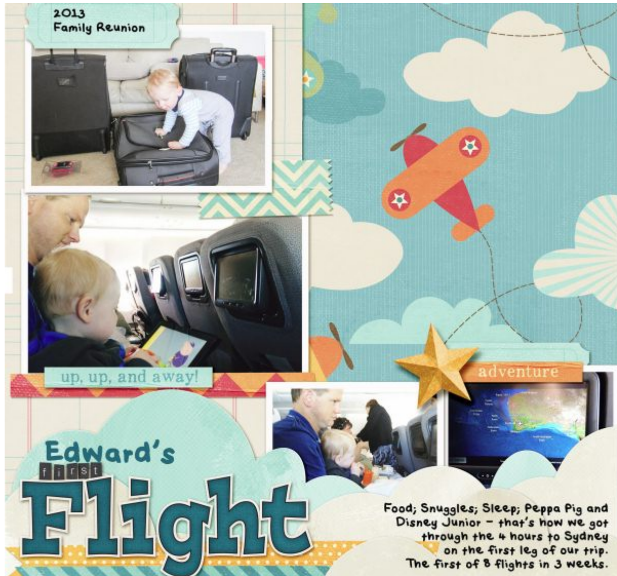
Layout by Melissa Shanahun