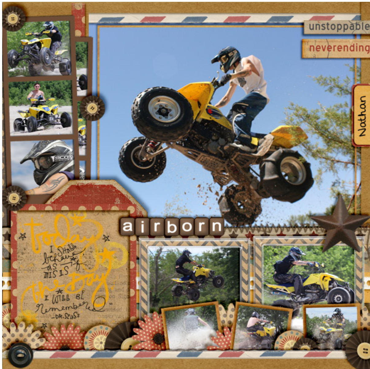
Layout by scrappingramma