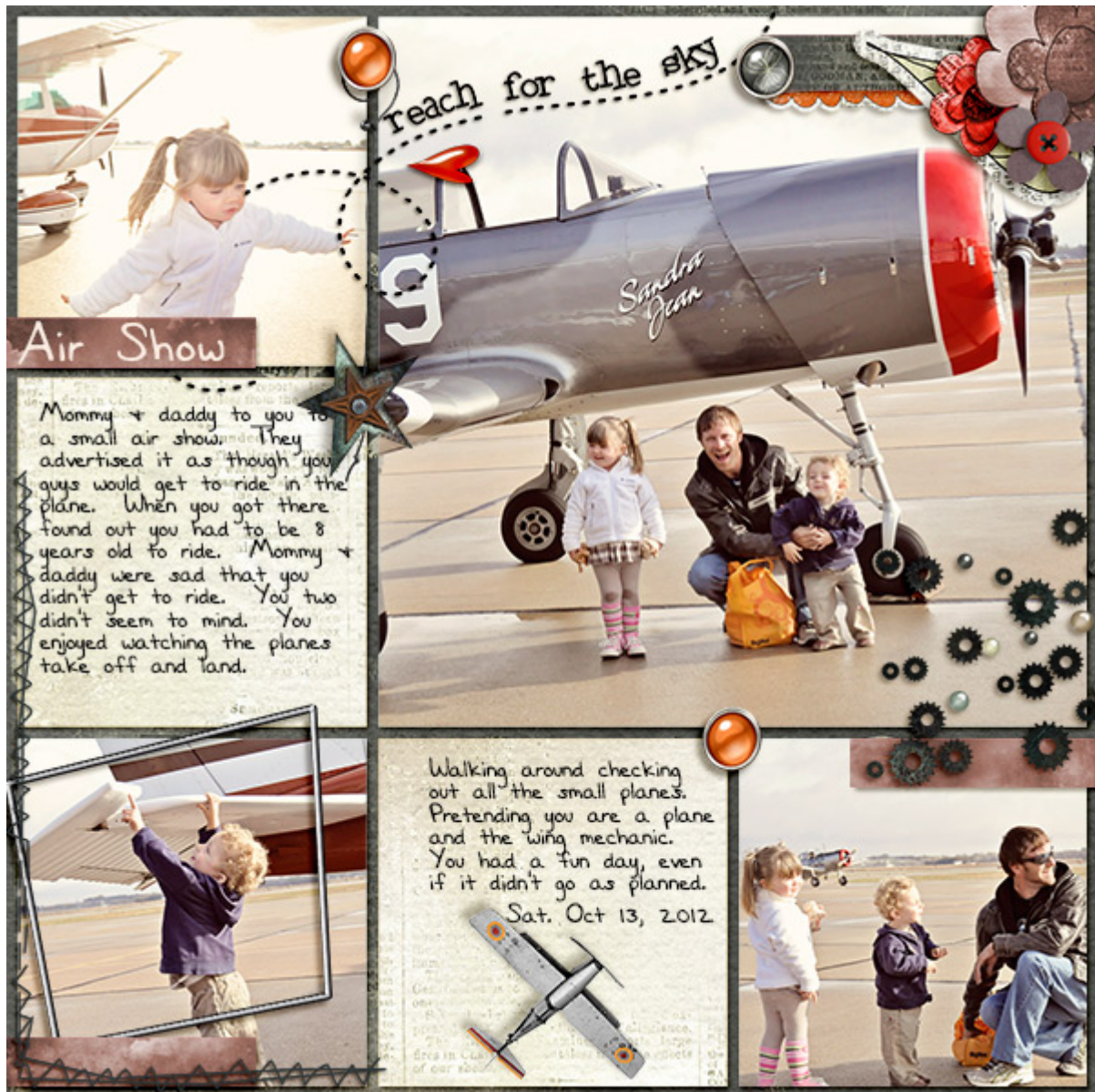
Layout by scrappingramma

But if you have the opportunity to document your first flight (or your child's), why not?