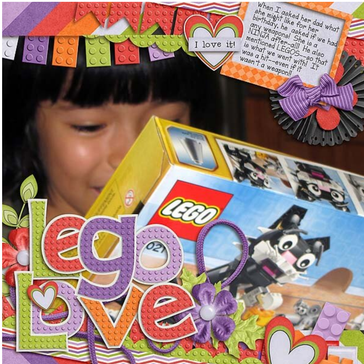
Layout by DeannaJ