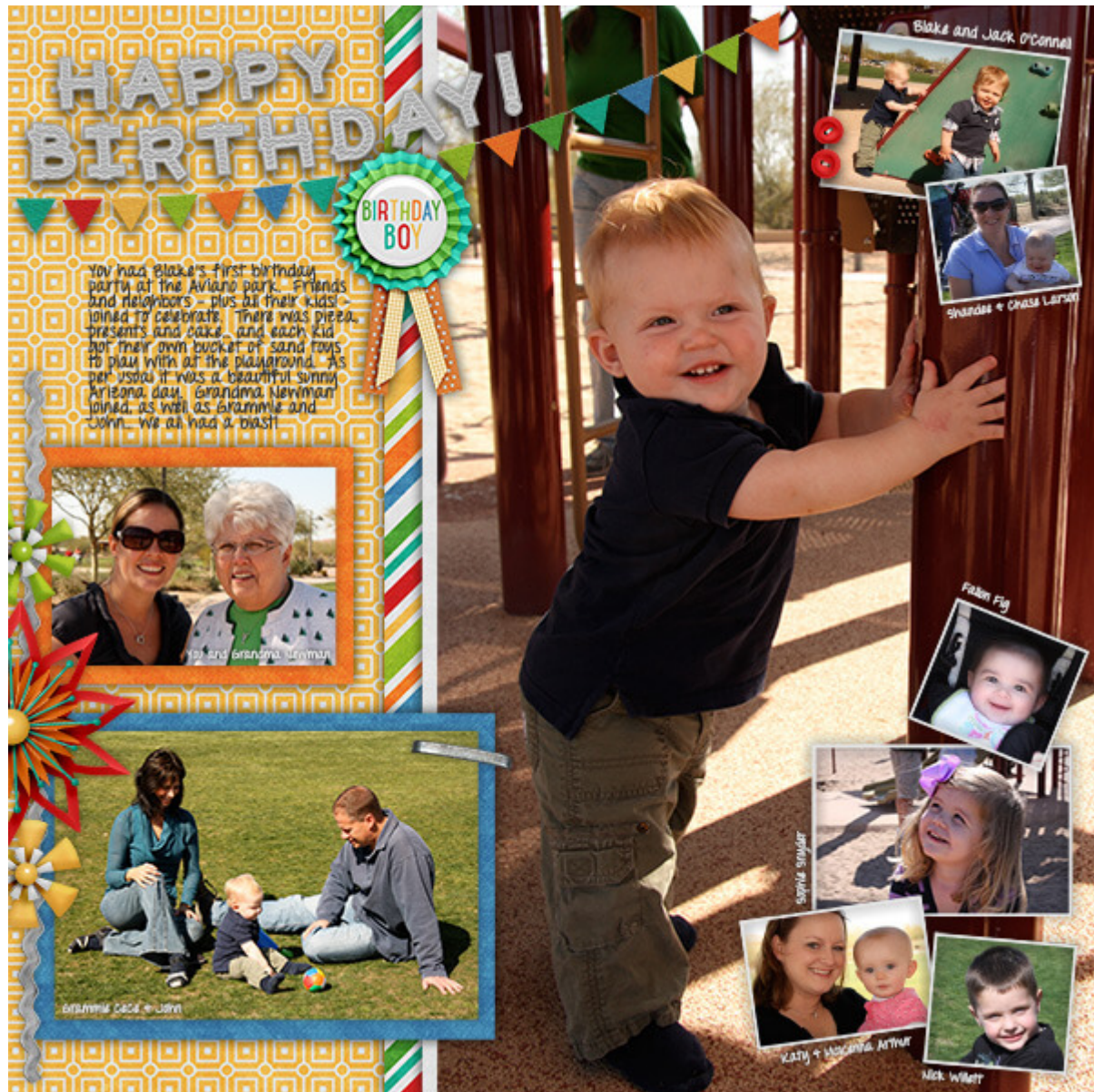
Layout by ShannonCollier