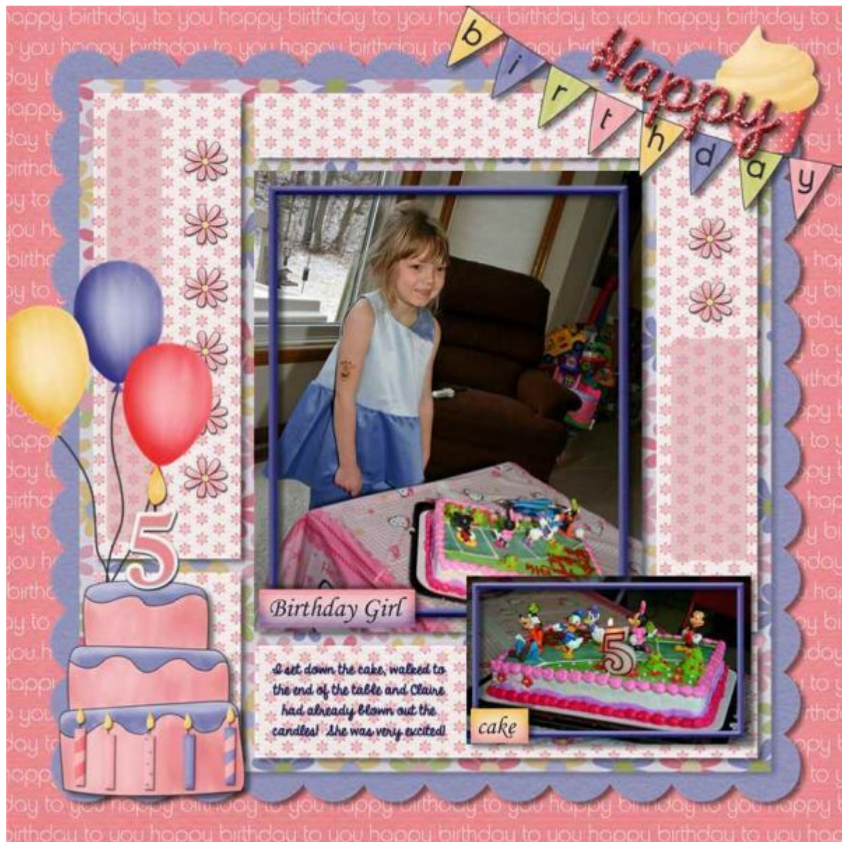
Layout by mnjenlittle