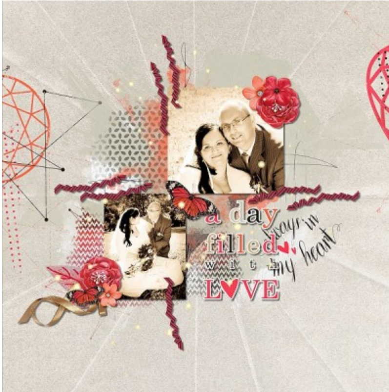
Layout by mijo

But it does not have to focus on the wedding day. Love is something that will last longer than that day, right? So, we can celebrate love within a couple for years to come or we can also have love way before a wedding. There is a love story, not just a love "day".