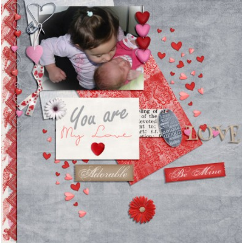
Layout by mag.azeline

And again, these feeling can also last into adulthood and our sisters or brothers can become our best friends.