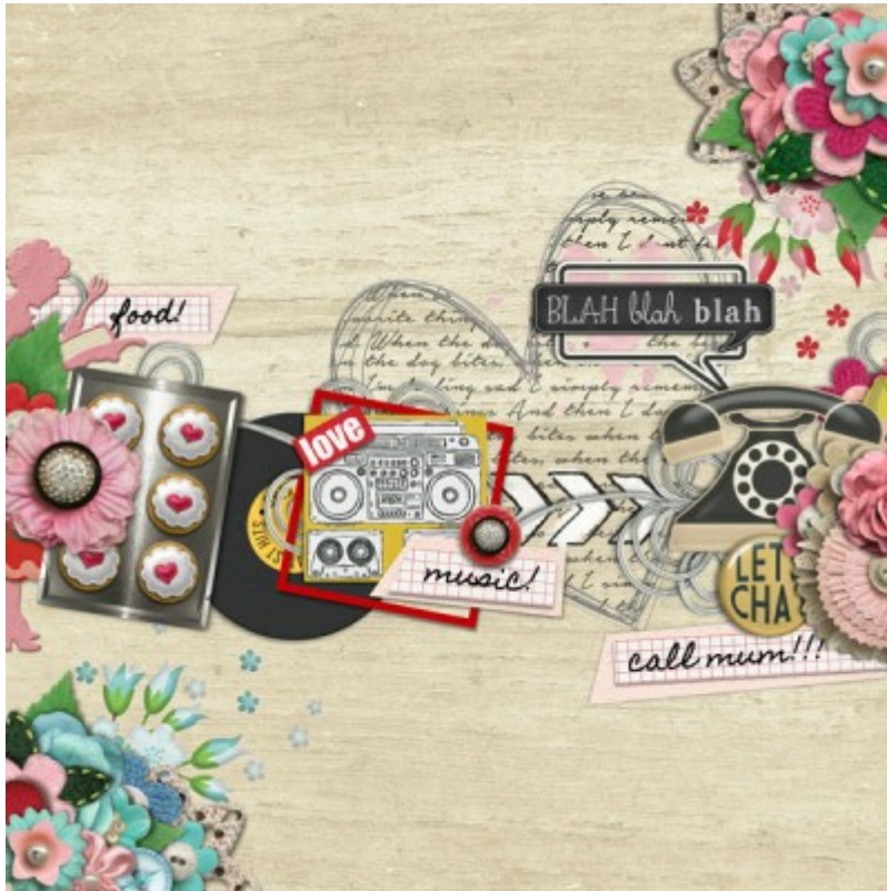
Layout by Mrs Peel

But sometimes, we might be a little shy about sharing OUR personal love of some things, so we can focus on someone else's love of things, places or activities.