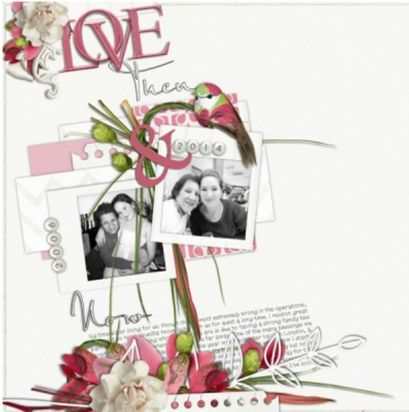
Layout by Mrs Peel