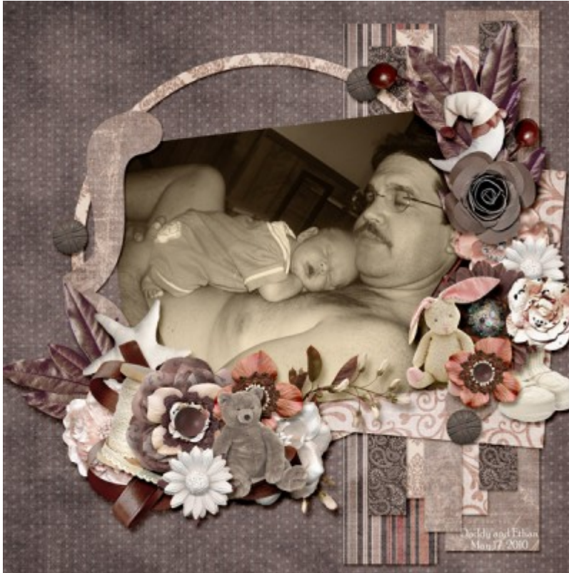
Layout by Alquafea

But a loving bond between a parent and a child is not only limited to the baby's first months; it lasts a long time. It will likely be expressed differently with a baby, a toddler or a teen, but it is still love.