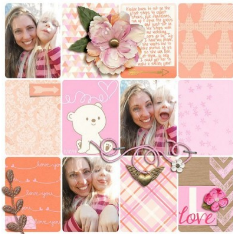
Layout by Erica Zane

Of course, it does not end at at time either. As long as we can have our parents, there can be love.