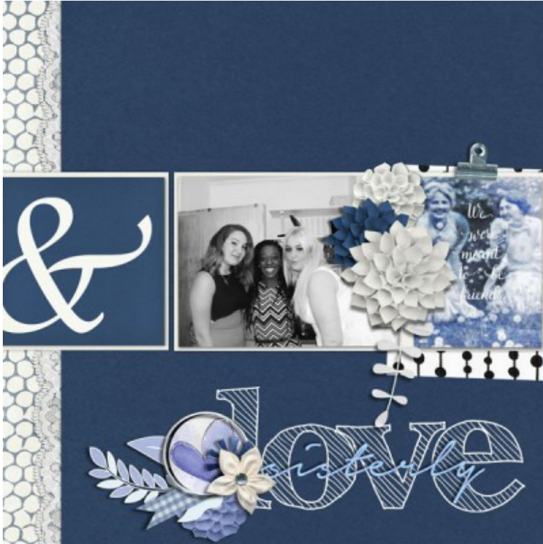
Layout by Mrs Peel