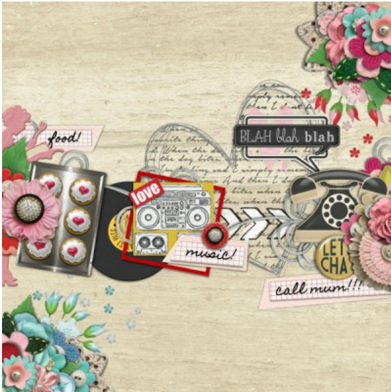
Layout by Mrs Peel

But sometimes, we might be a little shy about sharing OUR personal love of some things, so we can focus on someone else's love of things, places or activities.