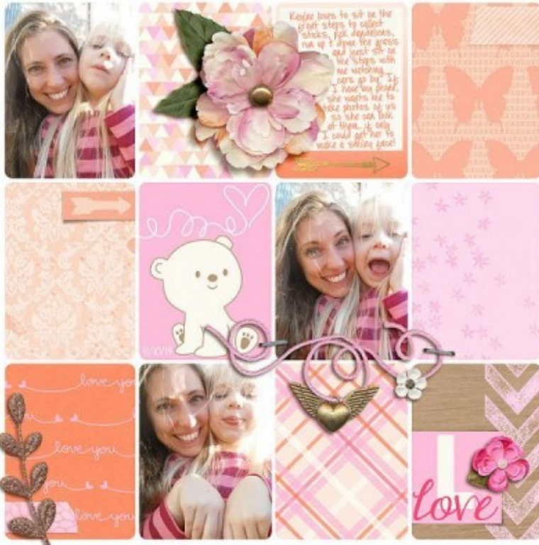
Layout by Erica Zane

Of course, it does not end at at time either. As long as we can have our parents, there can be love.