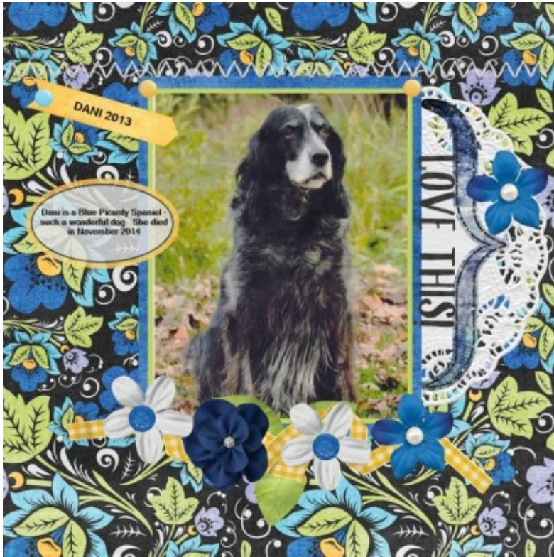
Layout by moe65

Did you ever create a layout about your pet?