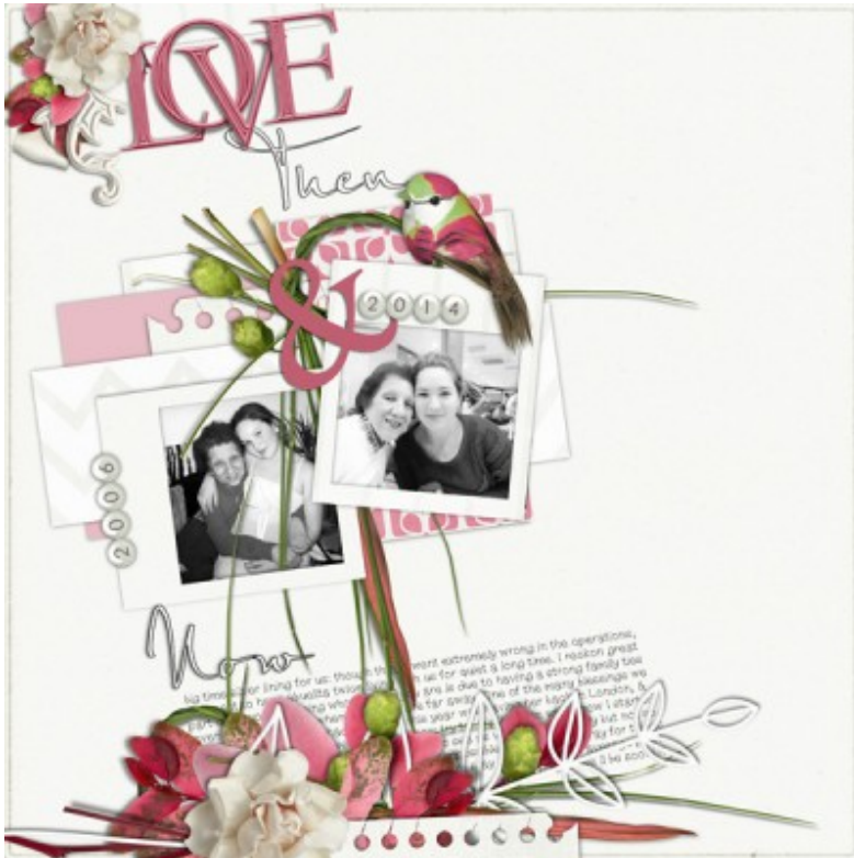
Layout by Mrs Peel