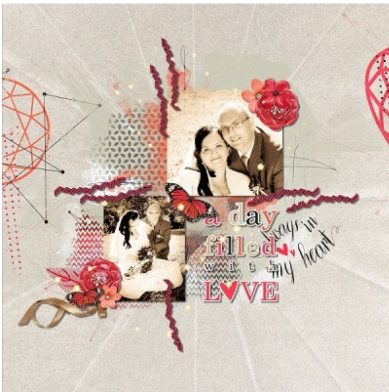
Layout by mijo

Some people will celebrate the actual event through their layout. Get a picture of the bride and groom, or write down their vows, and you can get a great page.