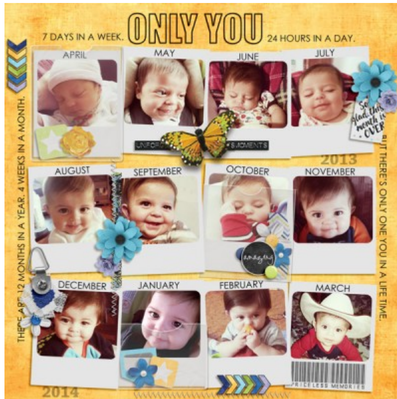
Layout by Sweet A Year in Review – December Pickle Barrel – Created by Jill

Photos of kids growing up are so much fun. I am sad that I missed that opportunity.