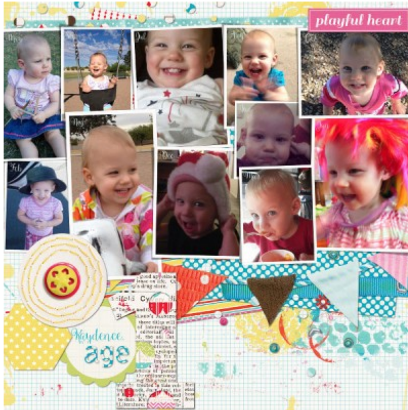
Layout by klee

And then, why not take a similar picture of yourself, or with your spouse, every month too? although the changes might not be as obvious as for a newborn, you might still see some grey hair appear, a mustache disappear, hair growing longer, then suddenly being shorter, etc.