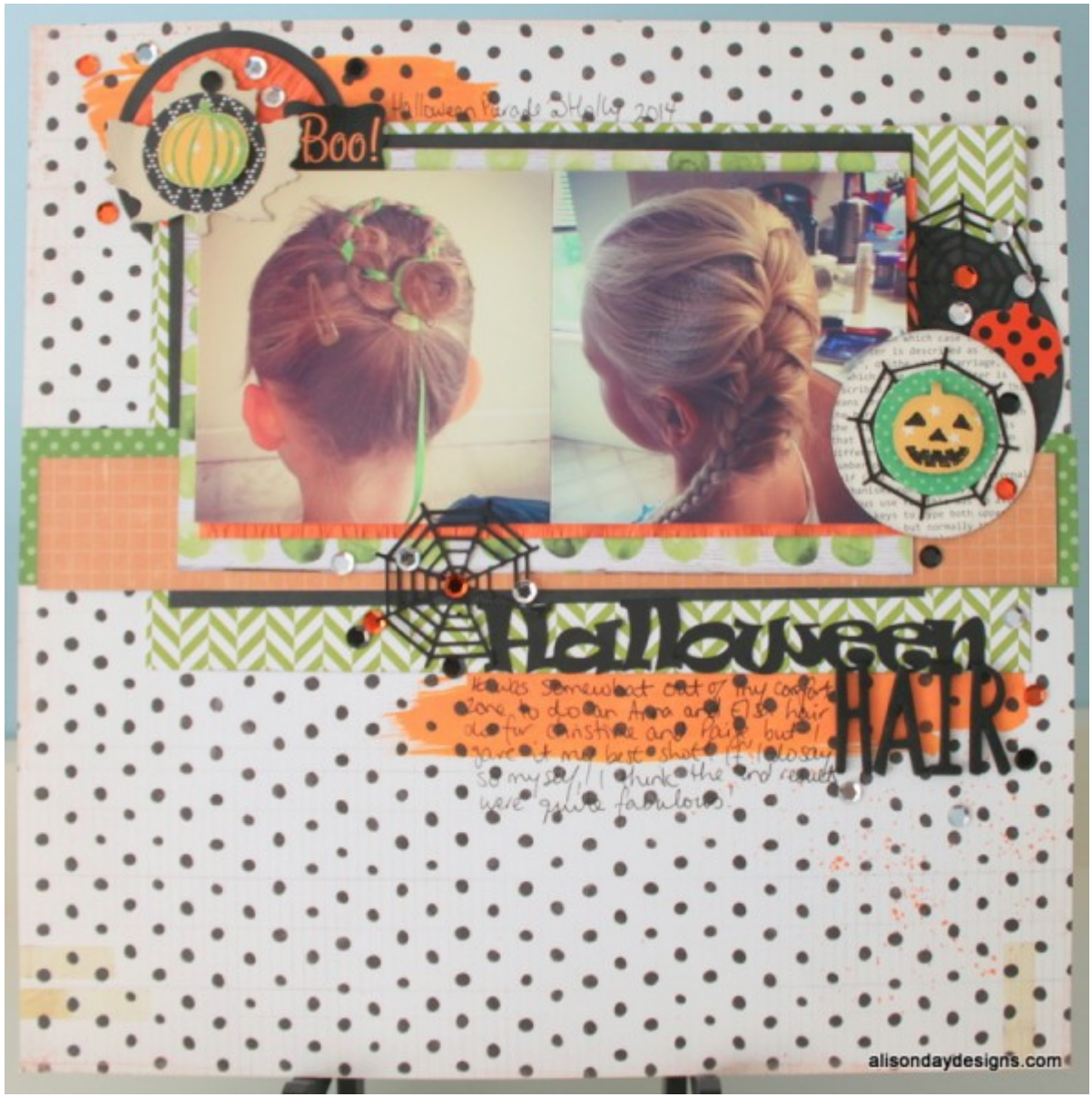
Layout by Alison Day

So, what layout will you create for this Halloween? What layouts did you create in the past? Post a link in the comments below or on the <u>Campus FB page</u>.