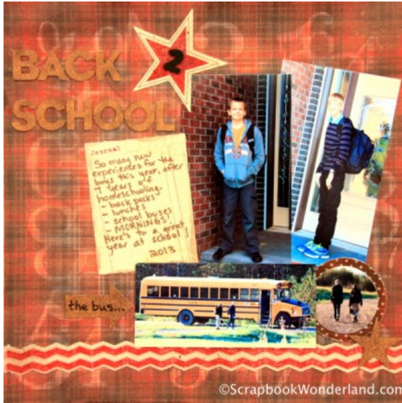
Layout from Alice