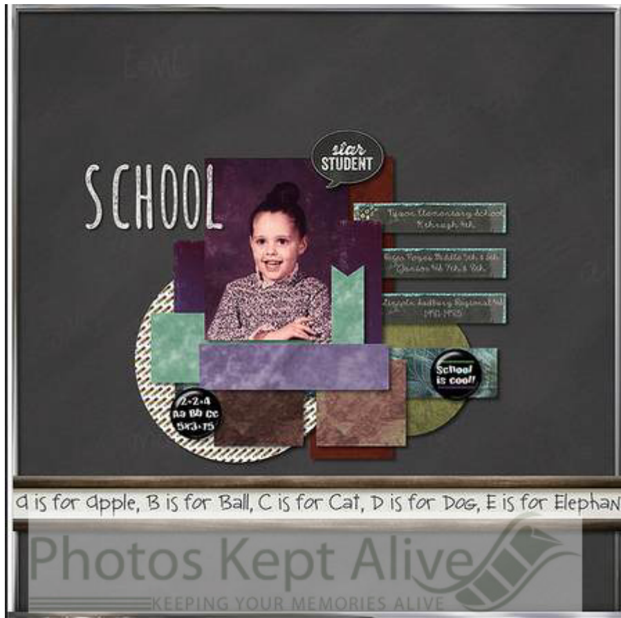
Layout from Karen