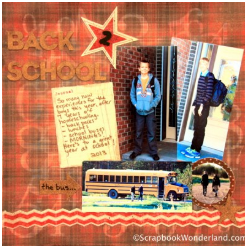
Layout from Alice