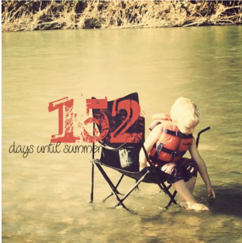
Layout from justjen8

There might be other ways or reasons you can use a large photo. Maybe you just like to use big photos. And that is quite ok too. But remember that with digital scrapbooking, you have a great advantage over traditional paper scrappers, in that you can use photos as large as your whole layout, and if you have the photo for it, why not take advantage of it. Minimal decorations will just let the photo speak, and if a photo is worth a thousand words, you might have a great story on your page!