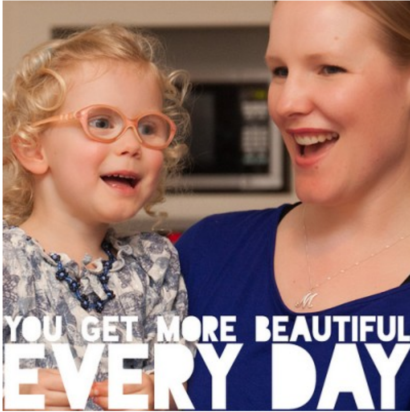
Layout from Melissa