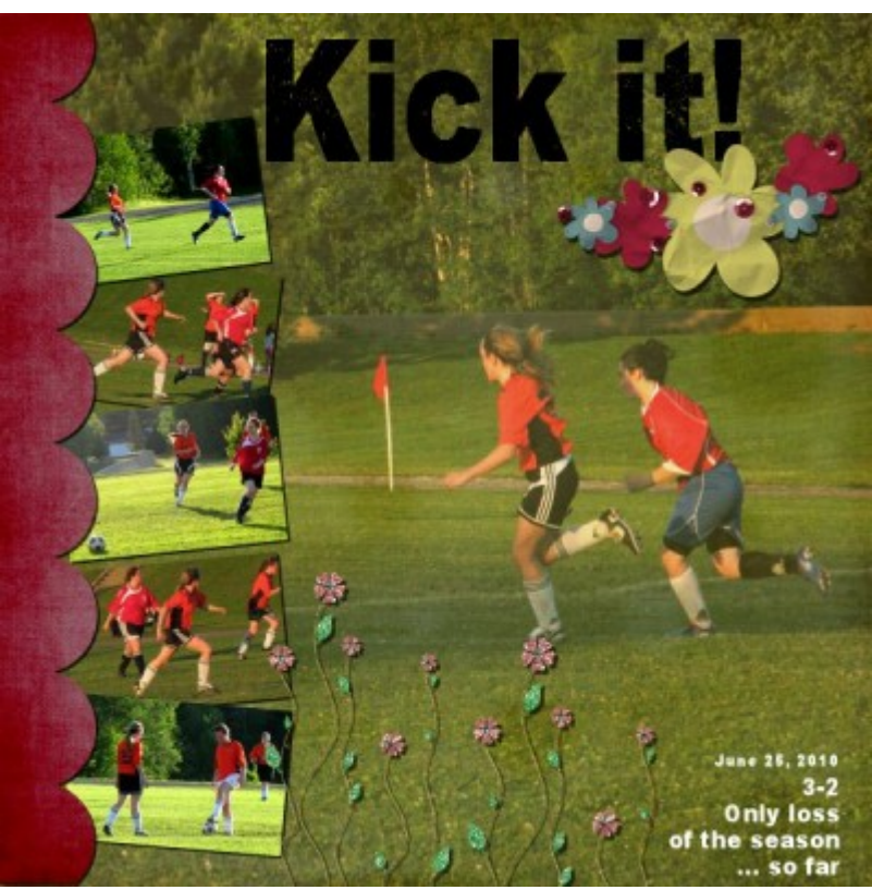
Layout from Cassel