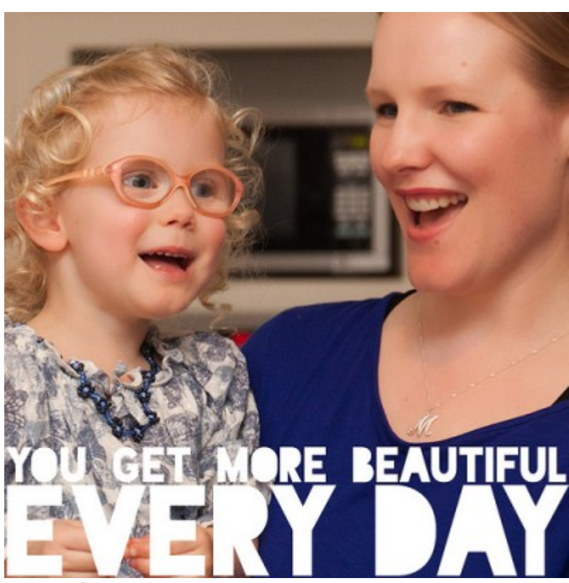
Layout from Melissa