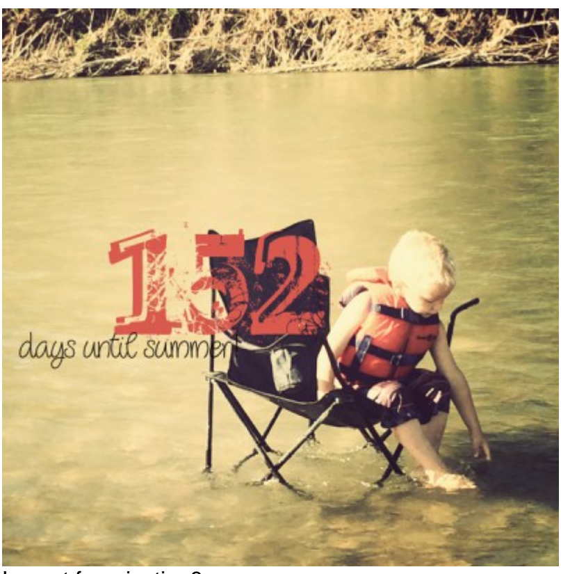
Layout from justjen8

There might be other ways or reasons you can use a large photo. Maybe you just like to use big photos. And that is quite ok too. But remember that with digital scrapbooking, you have a great advantage over traditional paper scrappers, in that you can use photos as large as your whole layout, and if you have the photo for it, why not take advantage of it. Minimal decorations will just let the photo speak, and if a photo is worth a thousand words, you might have a great story on your page!