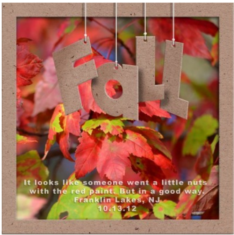
Layout from StefDesigns