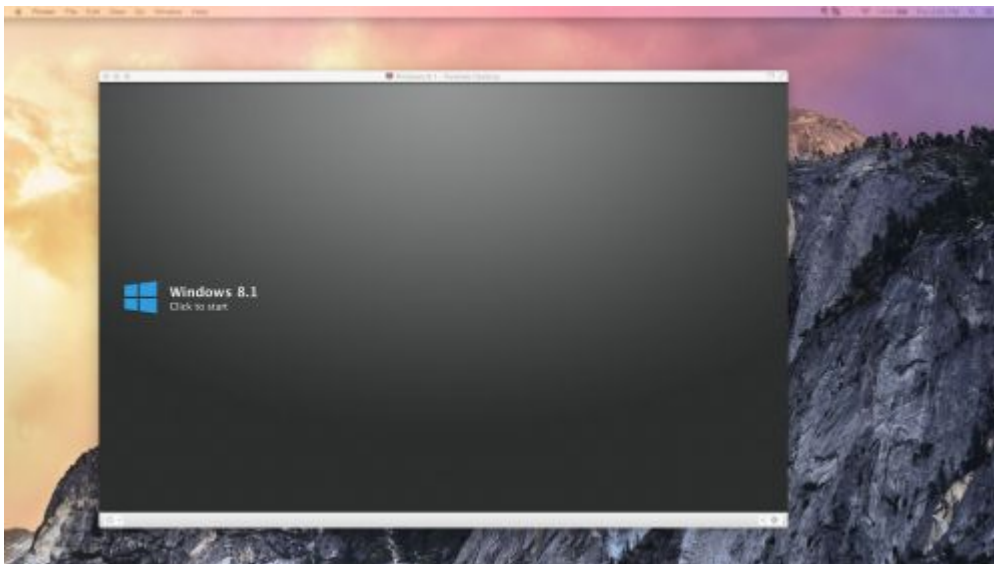
Screenshot of Windows 8.1 boot screen from inside OS X Yosemite

Once you’ve got Windows, the first method of installing it to your Mac is free—and while free is hard to argue with, it doesn’t necessarily always provide the better experience or get you the best productivity. And while the second method will cost you a few bucks, in my opinion, it brings some valuable benefits for a very reasonable price. Both solutions will ultimately get you the same end result—running Windows on your Mac—however, each takes a very different approach to get you there and your final decision should come down to more than just cost. So let’s take a minute and explore which Windows on your Mac solution is best for you.