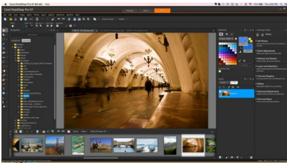
Corel PaintShop Pro X7 running on a Mac... but how?

Scrapbookers, photographers and other creative-types have long been fans of the Mac, but what do you do when your favourite software is only available on Windows? The Corel Photo team has been hearing some online chatter about a desire to see PaintShop Pro make its way to the Mac, but we don't expect that's going to happen very soon. So if you're one of those people who is on the Mac and want to use Corel's powerful photo editing and digital design package, what can you do? The simple answer is: "Just install Windows to your Mac."